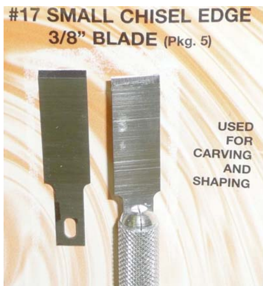
FIG. 1 #17 Blade

9.7 After 24 and 168 h, measure and record the length and width of the induced cut on the top of the joint and record the observed character of the tearing on the X and Y axis as noted