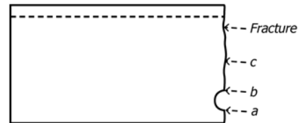
FIG. 2 Measurement of Reduction of Thickness after Fracture

10.1 coatings-zinc; galvanized coatings; steel products-metallic coated; zinc coatings-steel products