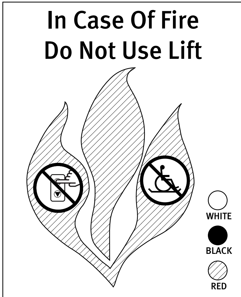
Fig. 2.6.7 Platform Lift Corridor Call Station Pictograph

lifts conforming to para. 2.1.4 shall not exceed 600 mm (24 in.).