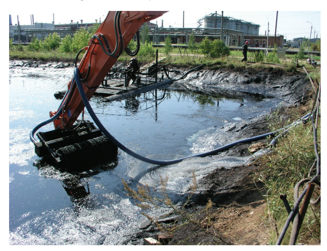
Figure 5.9 Oleophilic Drum Beach Cleaners