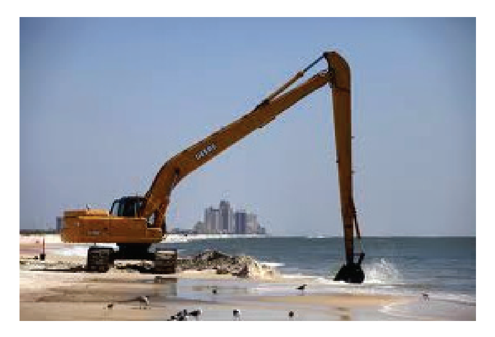
Figure 5.17 Track hoes Used for Excavation of Tar Mats at Tidal Interface