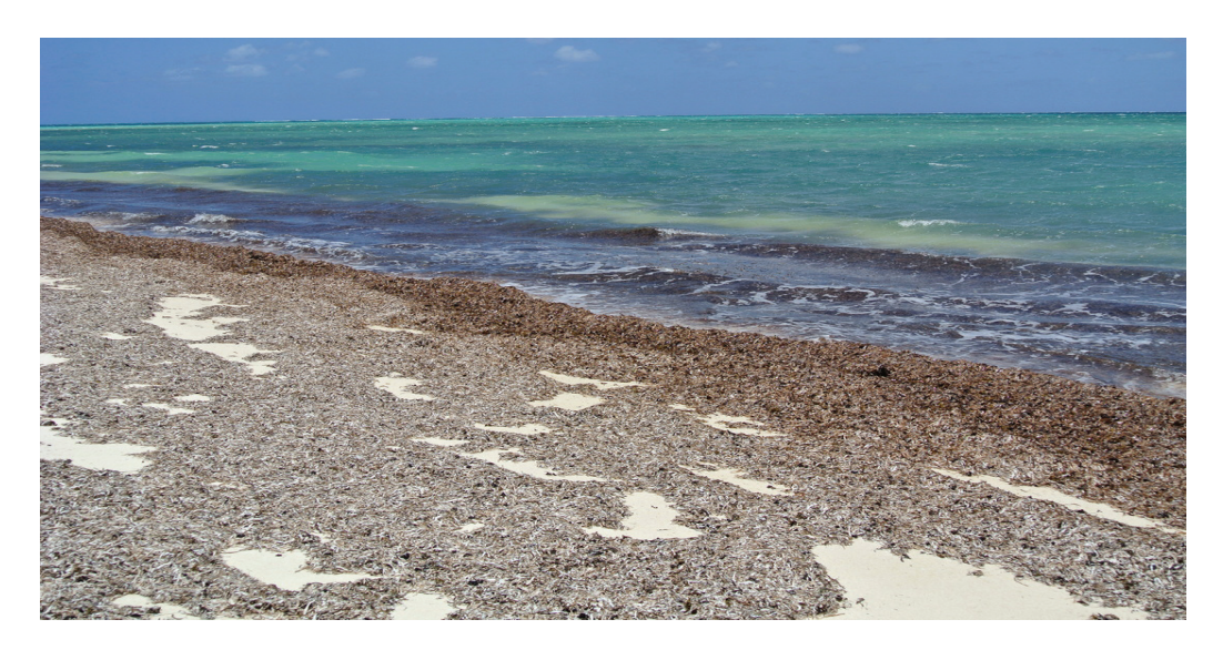
Figure 5.1 Typical Small Beach Debris

Stranded oil may remain on the surface of well compacted and damp sand beaches, allowing recovery without significant disturbance of underlying clean material. A variety of mechanized tactics can be used, including vacuuming, herding oil into depressions and/or excavated trenches and sumps for recovery, and use of oleophilic beach cleaners.