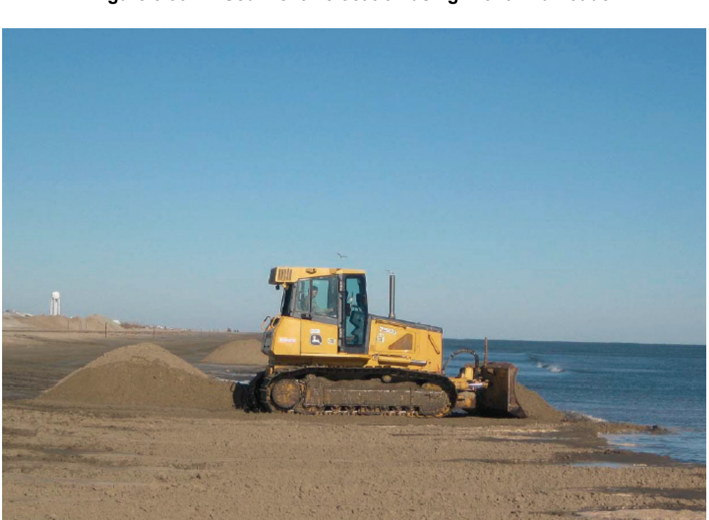
Figure 5.30 Sediment Relocation using Front-End Loader