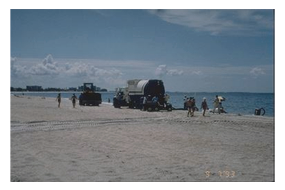
Figure 5.5 Vacuuming Oil off Fine Compacted Sand – Tampa Bay