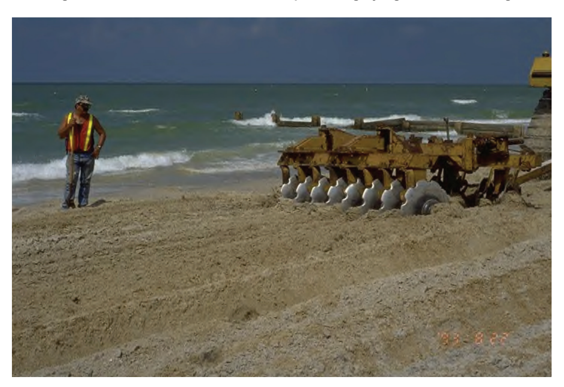
Figure 5.29 Deep Mixing