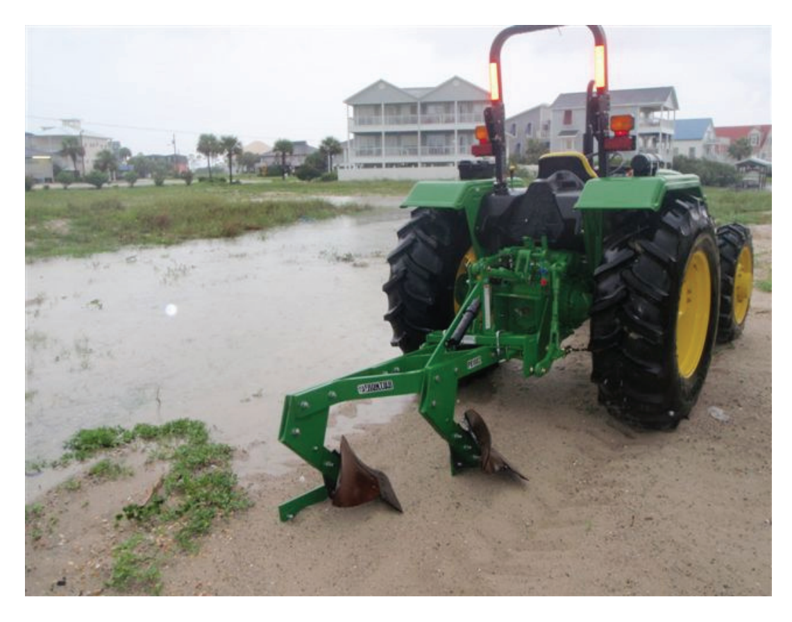
Figure 5.28 Shallow to Moderate Depth Mixing by Agricultural Plowing