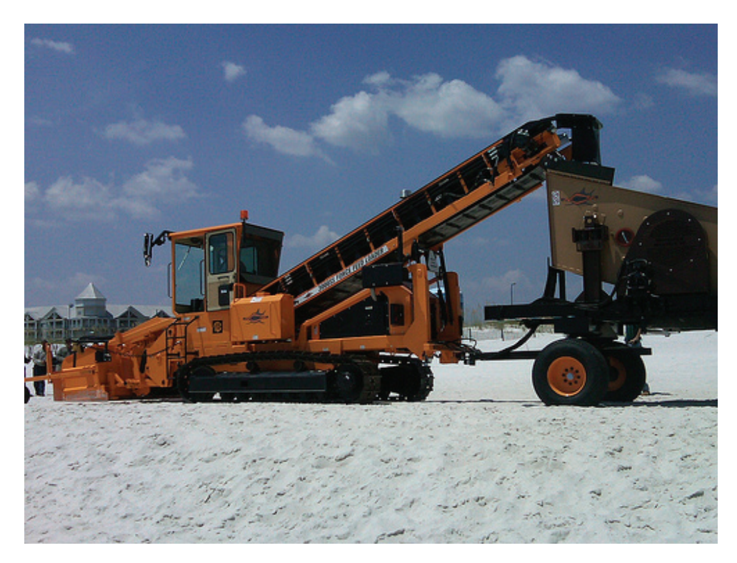
Figure 5.26 Typical Sand Shark

• Sand Shark. The Sand Shark consisted of a force-feed loader towing a self-contained power screen trailer. The force feed loader was designed to pick up and load windrowed material, snow, and other unconsolidated surface material. The basic design has been in service since at least the early 1970s, and was considered in some of the early beach cleanup research. During the Deepwater Horizon oil spill this concept was tested and found to be capable of excavating sand to operational depths of up to 25 cm (10 inches) (Owens, 2011). In addition to excavation, it was used to tow a trailer-mounted vibratory fixed screen normally used by the mining industry. The combined package was capable of excavating oiled sand, separating non-friable sand/emulsion accumulations, and returning clean sand to the beach in a single operation. Multiple units were assembled and widely used in the response. A typical Sand Shark is shown in Figure 5.26.