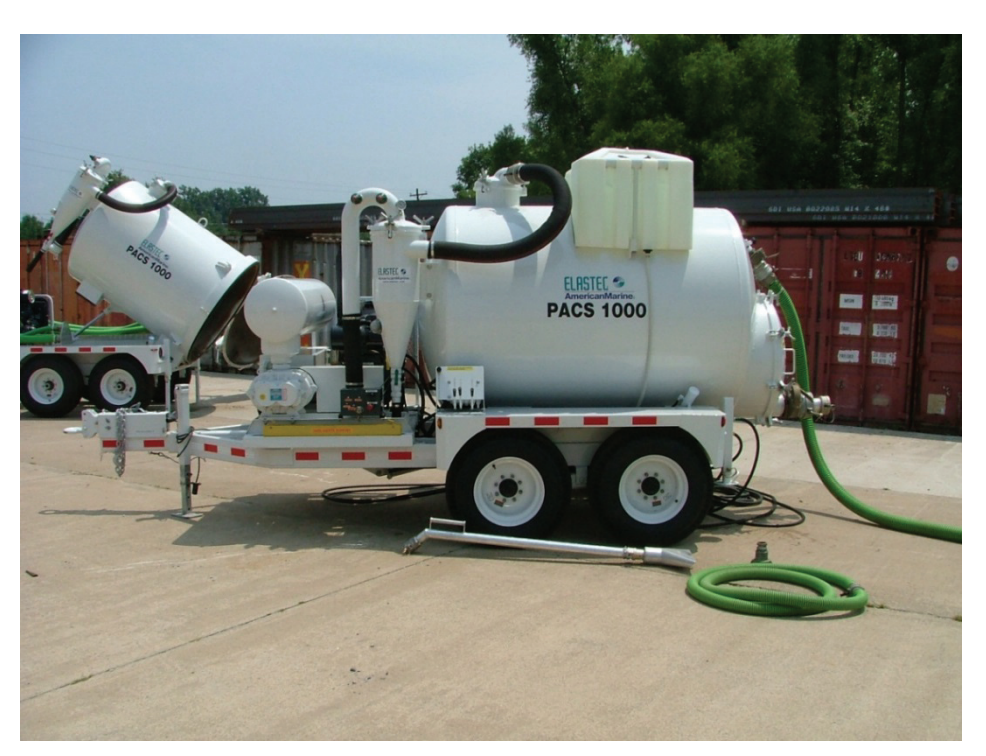
Figure 5.3 Use of Portable Vacuum System to Recover Oil