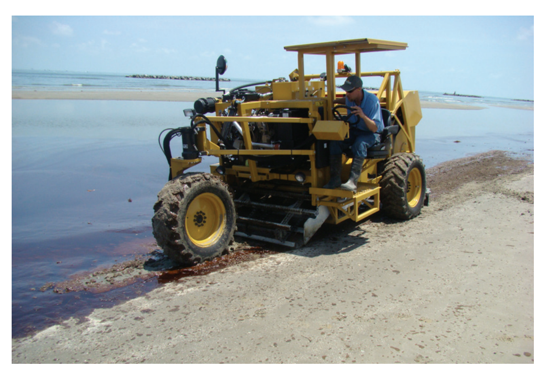
Figure 5.20 Rake-type Beach Cleaner