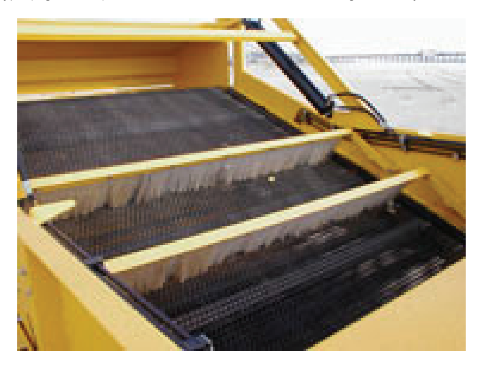
Figure 5.22 Rotating Screen with Brushes to Breakup Sand Accumulations

Other configurations include a self-propelled, traveling screen-type beach cleaner (Figure 5.24) and a walk-behind type (Figure 5.25). The walk-behind machine screens using oscillatory fixed screens.