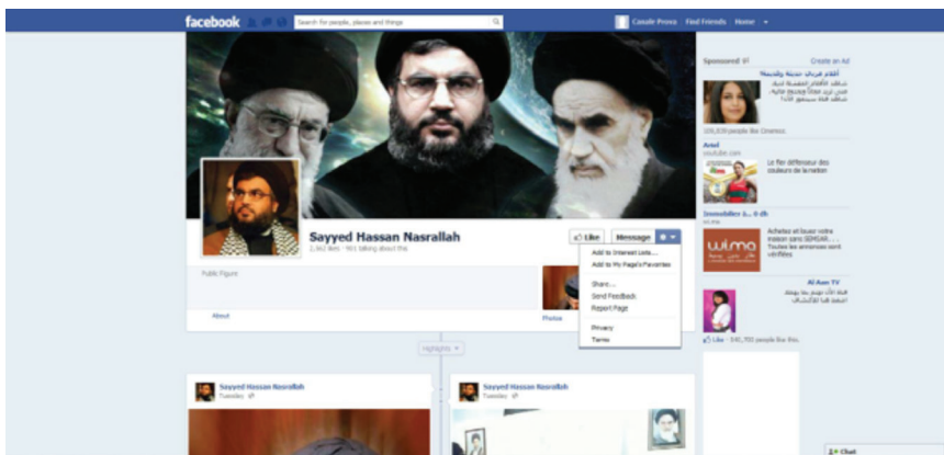
The "Sayyed Hassan Nasrallah" Facebook page was created October 21, 2011, and currently has 2,693 "likes." The very first post, on the same day, stated in English: "O Allah, Please Clean This World From Jewish Contamination."

go to them and teach them! . . . [I] mean, if you have a group of 5,000 people, with the press of a button you [can] send them a standardized message. I entreat you, by God, to begin registering for Facebook as soon as you [finish] reading this post. Familiarize yourselves with it. This post is a seed and a beginning, to be followed by serious efforts to optimize our Facebook usage. Let's start distributing Islamic jihadi publications, posts, articles, and pictures. Let's anticipate a reward from the Lord of the Heavens, dedicate our purpose to God, and help our colleagues. 7