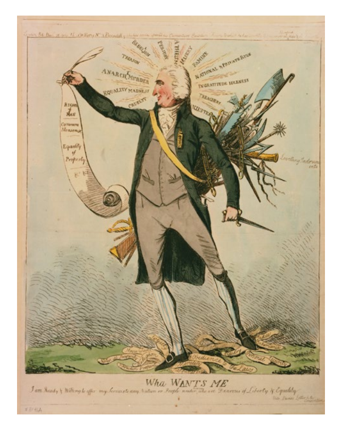
Figure 1: Isaac Cruikshank. "Wha Wants Me." London: S. W. Fores, 1792.

is trampling, such as "Obedience to Laws," "Morality," "Religion" "Loyalty," "Magna Charta," and "Personal Security."