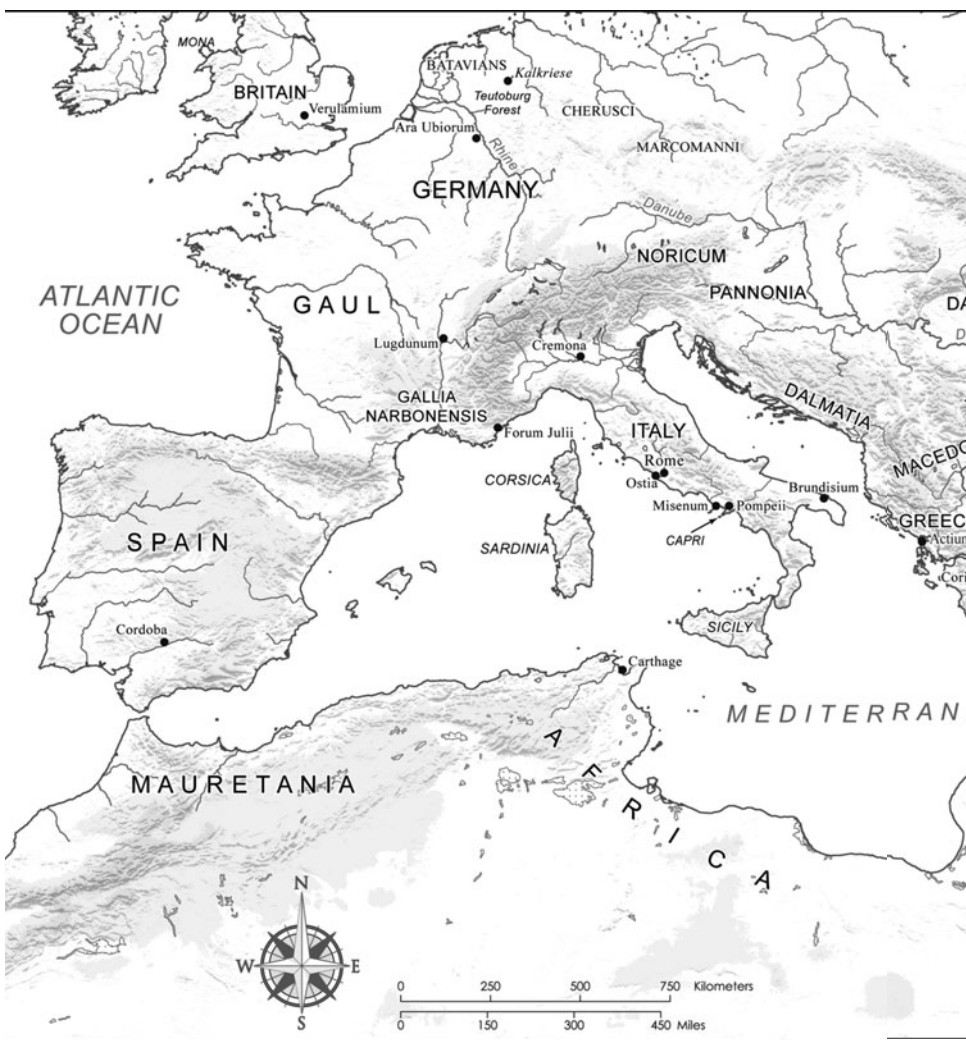
Map of the Roman Empire