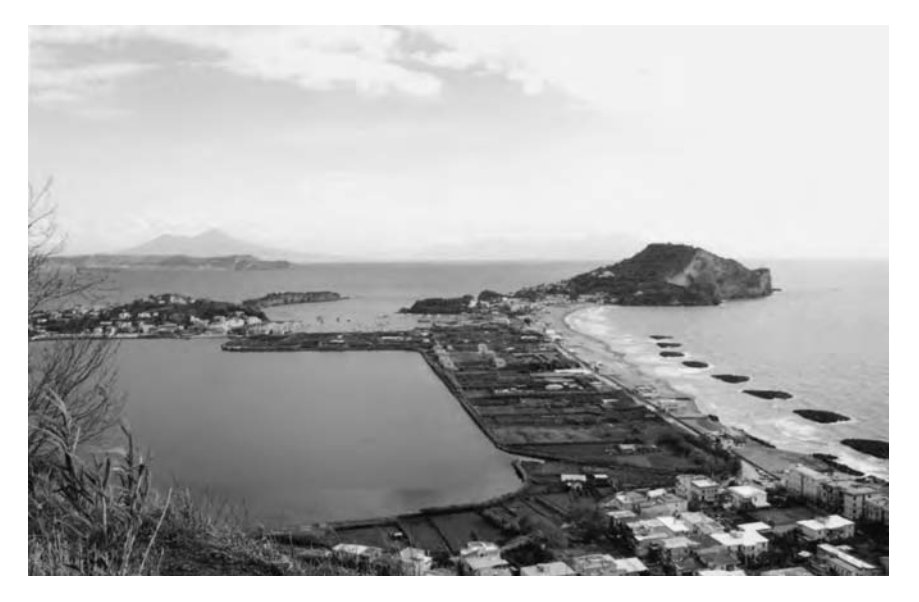
Figures 3.1 and 3.2 Misenum as it is now. Cornelia's villa was somewhere in this area.