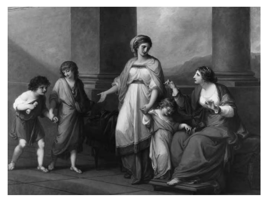
Figure 5.1 A post-classical representation of Cornelia: Angelica Kauffman's 1785 painting, Cornelia, Mother of the Gracchi, Pointing to her Children as Her Treasures.

house (Trevelyan 1976), as by the upsurge of sentimental and historic depictions of motherhood and other family scenes from the late eighteenth century (Duncan 1973).<sup>7</sup> Jean-Francois-Pierre Peyron's 1781 painting Cornelia , Mother of the Gracchi is a smaller version of a painting commissioned by the Abbé de Bernis. It includes a statue plinth, with the fragment MP GRACCUS visible. The 1785 oil painting by the Swiss painter Angelica Kauffman ( Cornelia , Mother of the Gracchi , Pointing to her Children as Her Treasures ) is one of the few which includes Sempronia. Either other artists did not regard Sempronia as a jewel or, like Seneca, they were unaware that Cornelia had three children who survived to be adults.