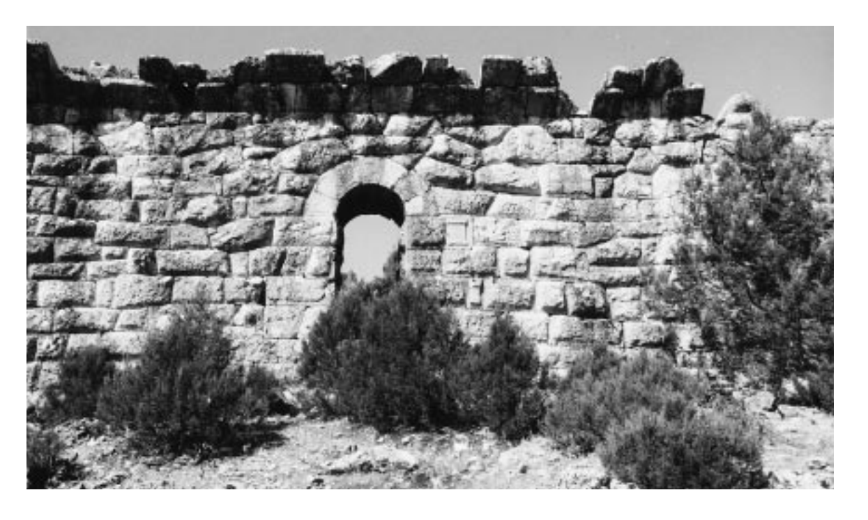
PLATE 2. The open-air sanctuary of Theos Hypsistos at Oenoanda on the inner side of the hellenistic city wall.