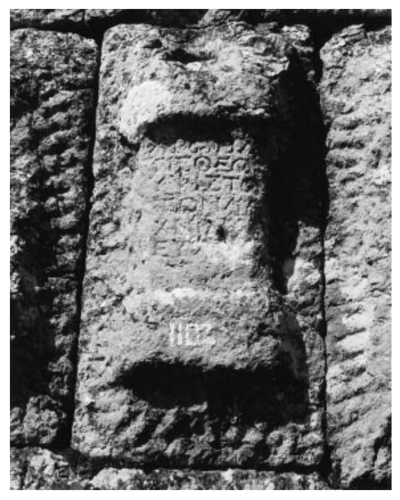
PLATE 3. Chromatis dedicates a lamp to Theos Hypsistos (Catalogue 234).

at dawn. The sanctuary, where the faithful gathered for worship, was the semicircular open area in front of the oracle inscription (Pl. 2; see below §3). As the verses told them, they would have stood facing east, with their backs to the tower and the text, gazing up at heaven and offering their prayers to all-seeing Aether.<sup>11</sup>