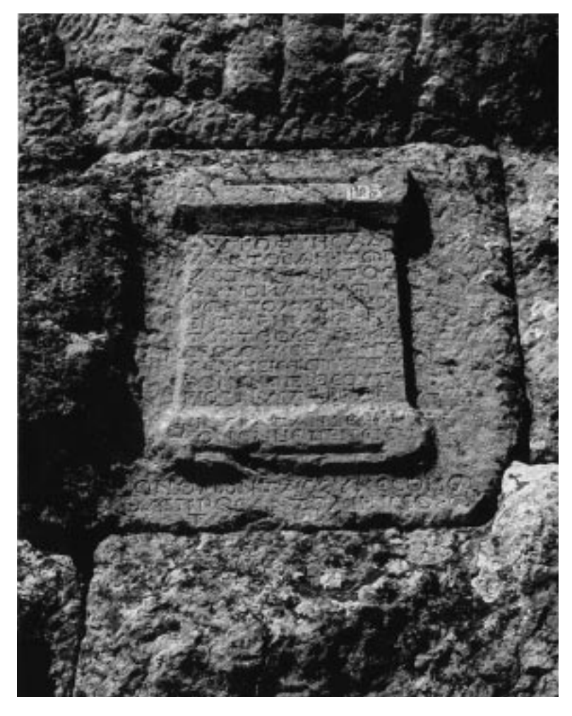
PLATE 1. The oracle of Apollo at Oenoanda (Catalogue 233).

of the Hellenistic city wall of Oenoanda, above and to the right of an arched doorway which led into the back of the round tower in the southern section of this wall (Pl. 1). The last line of the oracle prescribed prayer addressed to the rising sun, and the wall section where the block was placed, which runs north-eastwards along a prominent ridge, was the first part of the whole site of Oenoanda to be struck by the sun's rays