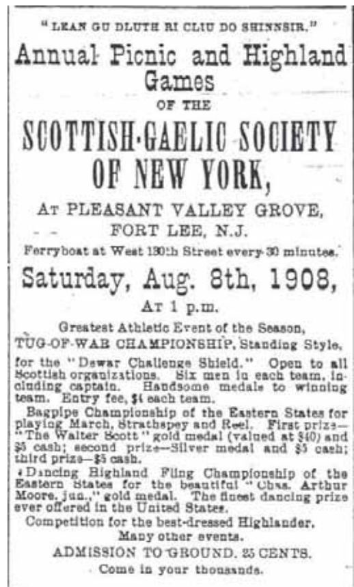
Figure 3. 1908 Scottish-Gaelic Society of New York Highland Games advertisement

It is likely that the rivalry between Gaelic Society and the Celtic Society of New York had the effect of enhancing the overall support for Gaelic in New York. Given that most Gaels had only experienced Gaelic language and culture as a feature of rural life in impoverished areas, excluded from the institutions of wealth, power and prestige, any usage of Gaelic in New York must have seemed to them to be an advance over the sad state of the language in remote and neglected corners of the world. It is not surprising to