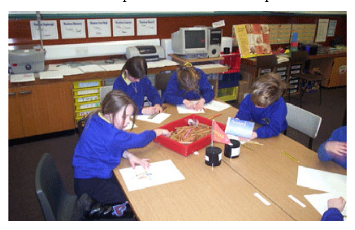
Figure 5. Brastyl 2 (Years 2 and 3).

The Department of Education's Manx Language Team of peripatetic teachers Yn Unnid Ghaelgagh (the Manx Language Unit) is also based at St John's old school building. In addition to the partnership with the Department of Education to run Bunscoill Ghaelgagh, Mooinjer Veggey also has a contract with the Department to run three preschool nurseries.