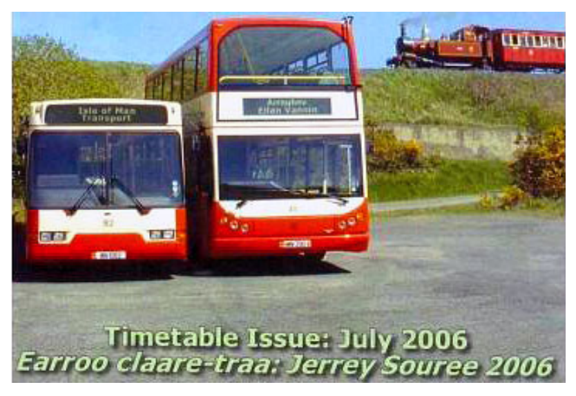
Figure 2. Bilingual bus timetable.

The signal the Isle of Man Government sends to the outside world is that the Island population not only values and is aware of their heritage, but can also afford to indulge it. It makes economic sense in terms of what remains of the tourist industry to market the Island as having a unique culture within the British Isles, and the language is part of that culture. Thus increased prosperity has been good for the Manx language and the preservation of a certain