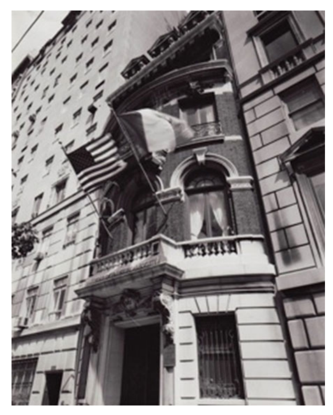
Figure 3. Exterior of American Irish Historical Society 991 Fifth Avenue. http://www.aihs.org