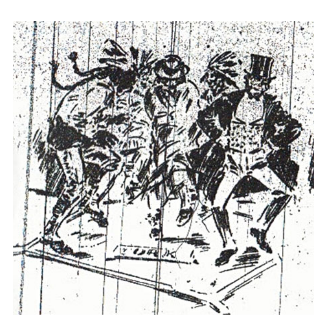
Figure 4. Chief Rain-in-the-Face and fair organizers standing on the map of Ireland. Illustration printed in the New York Herald. 14 May 1897.

"Diamond Flossie," a wealthy west side resident (Papal Stole is Missing Still p. 1).<sup>5</sup> Fair attendees also got a lively visit by Native Americans, including Chief Rain-in-the-Face, John Charging Horse and twenty five others who were performing with WC Cody's Wild West Show across town (Figure 4). When Chief Rain-in-the-Face visited the fair, he addressed the crowds and made an impassioned plea for Native American rights, and refused to kiss the replicated Blarney Stone, on account of its being, in his words, a "white man's idol" (Figure 5).<sup>6</sup> And there were the quaintly amusing, if bewildering, fair attractions comically documented by the New York Times , like Mascot, the can-eating goat of Dublin, who had a bucking contest with a Harlem billy goat, winner never specified, and activities like the donkey races, where the last animal to cross the finish line wins (At the Irish Fair (a) p. 5).