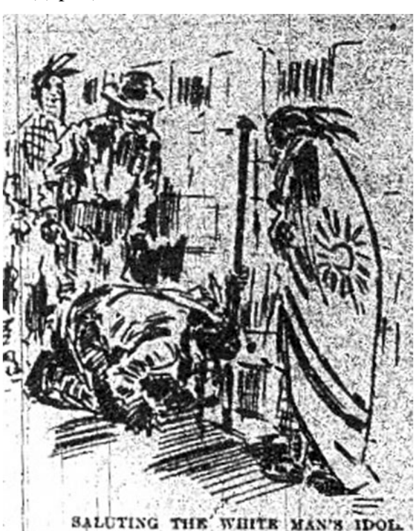
Figure 5. Chief Rain-in-the-Face examining the Blarney Stone. Illustration printed in the New York Herald . 14 May 1897.

But what got the most attention and proved to be the biggest moneymaking exhibit for the fair organizers was an attraction sponsored by the New York Journal . It was a giant topographical map of Ireland, with each of the thirty two counties filled with the native soil of each. The Irish World reported: