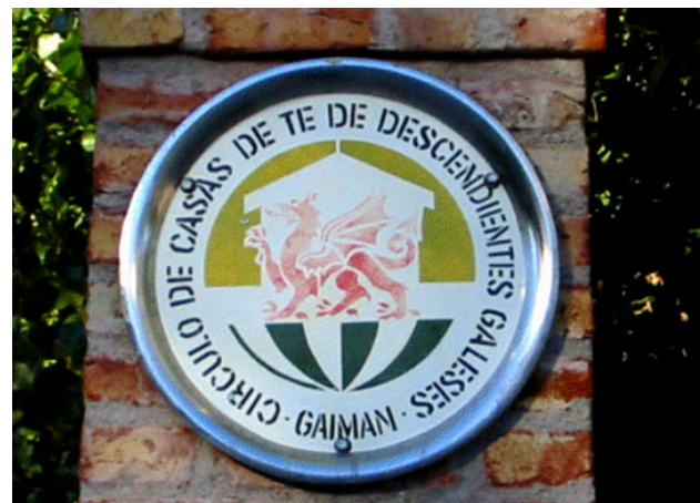
Figure 5. ' Círculo de casas de té de descendientes de galeses ' plaque (Gaiman, Chubut).