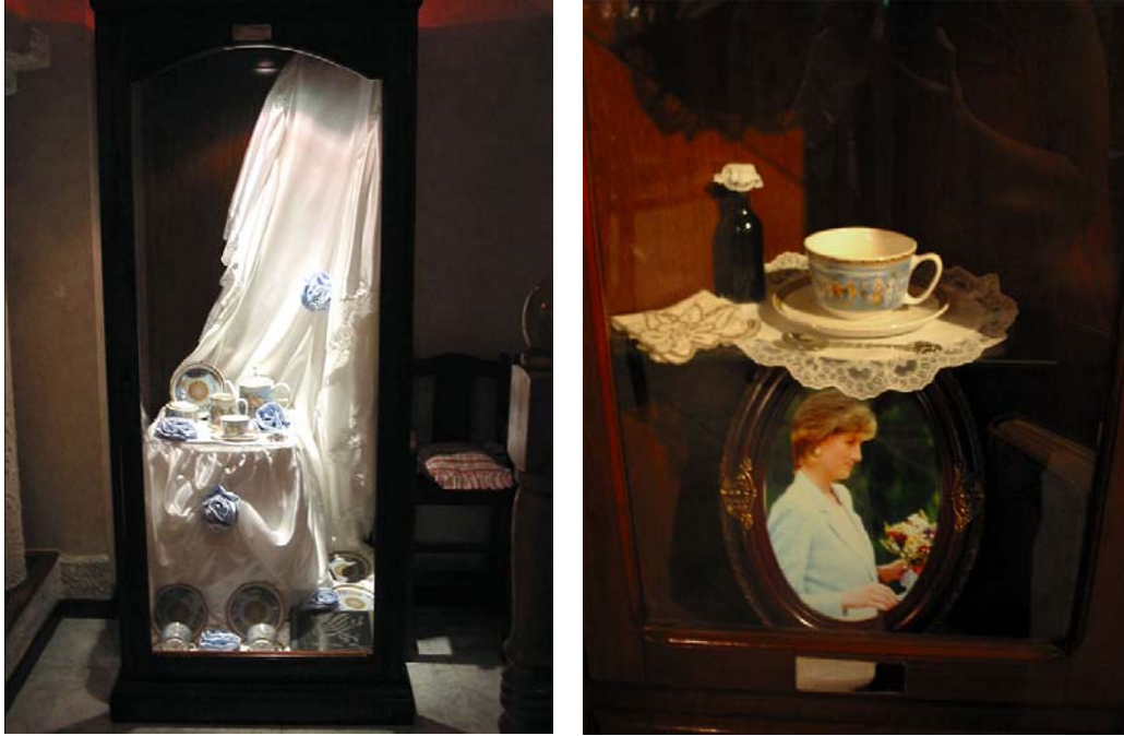
Figures 9-10. Showcase with the special crockery and table linen used on the day of the visit and detail of the cup from which she sipped and bottle with the rest of the tea left in her cup (on display in the tea house).

reproducing the romanticised tea ceremony as they would have experienced it at their original family home—and that is clearly not the case with the new tea house. After all, shouldn't the sweet treat be only an excuse to learn more about the wider culture and traditions of the little Celtic nation? How dare these outsiders set up a 'Welsh Tea House' if they are not even Welsh in the first place?