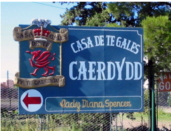
Figure 4. Tŷ Te Caerdydd advertisement in Gaiman, Chubut.

As a snap reaction to the kidnapping of a most lucrative aspect of their heritage, the owners of the 'genuine' Welsh tea houses decided to undertake a symbolic marking of their identity by creating the ' Círculo de casas de té de descendientes de galeses ' (Figure 5) (an association pooling the efforts of tea house owners of Welsh descent) in order to guarantee the