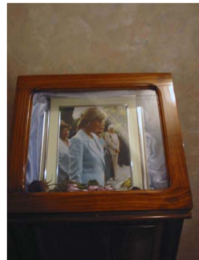
Figures 6-8. Commemorative plaques and photographs of Lady Di's visit to Tŷ Te Caerdydd (on display in the tea house).

Of course a good number of locals bemoan in private conversation the commercial success of this 'illegitimate appropriation', denouncing that the non-Welsh origins of the owners of the 'alien' tea house prevent them from providing an 'authentically Welsh' tea service. Alongside the appetising experience, tea houses owned by Welsh descendants are supposed to offer access to the history and culture of the community as part of the service through interaction with the protagonists of the epic and their descendants. In a sense, they would just be