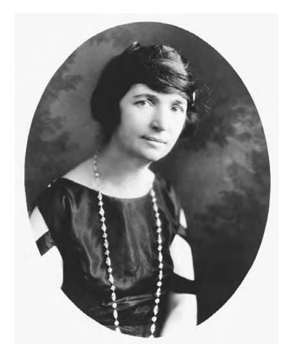
Margaret Sanger

The following spring found me still seeking and more determined than ever to find out something about contraception and its mysteries. Why was it so difficult to obtain information on