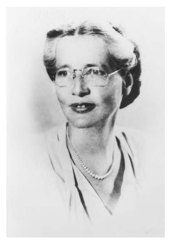
Helen Brooke Taussig

that it can be oxygenated. (Nuland 1988, 438)