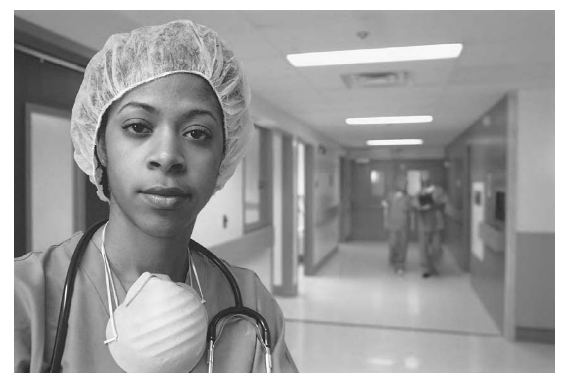
Women of color in medicine have to face both gender and racial discrimination

rights concentrated upon race. The international convention with the greatest number of signatories is that on race. Within the United Nations, more resolutions deal with race than with any other subject. And certainly one of the most long-standing and frustrating problems in the United Nations is that of race. (Lauren 1996, 4)