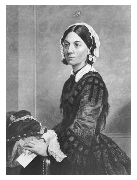
Florence Nightingale

Nightingale's thirty-eight nurses were from both Catholic and Protestant backgrounds; their home churches were in agreement that all would have to obey Nightingale as their superior in the field. "The Roman Catholic bishop at once agreed