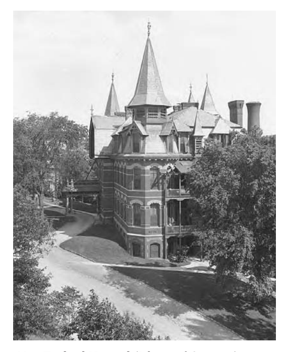
New England Hospital

Founded initially as the New England Hospital for Women and Children in Boston in 1862, the New England Hospital, which changed its name in 1949, was one of the first hospitals for women and children staffed by female physicians. Few of the women's medical colleges at the time had