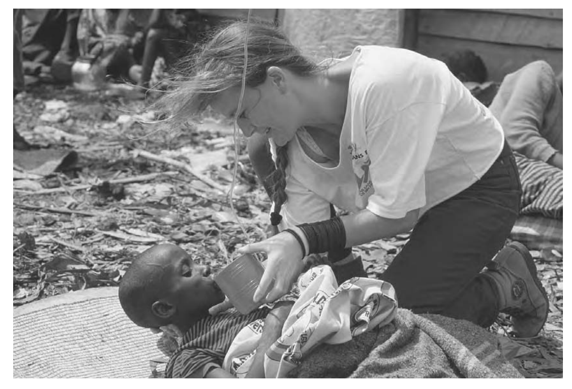
Women have served for centuries in wars and epidemics

the field tending to soldiers' wounds or at home doing the men's work, women still had very little power. They continued to be less valued both by society and under the law: "Employers in all nations paid women at standards well below wages for men with equivalent skills, denying them fringe benefits whenever possible" (Kolko 1994, 96).