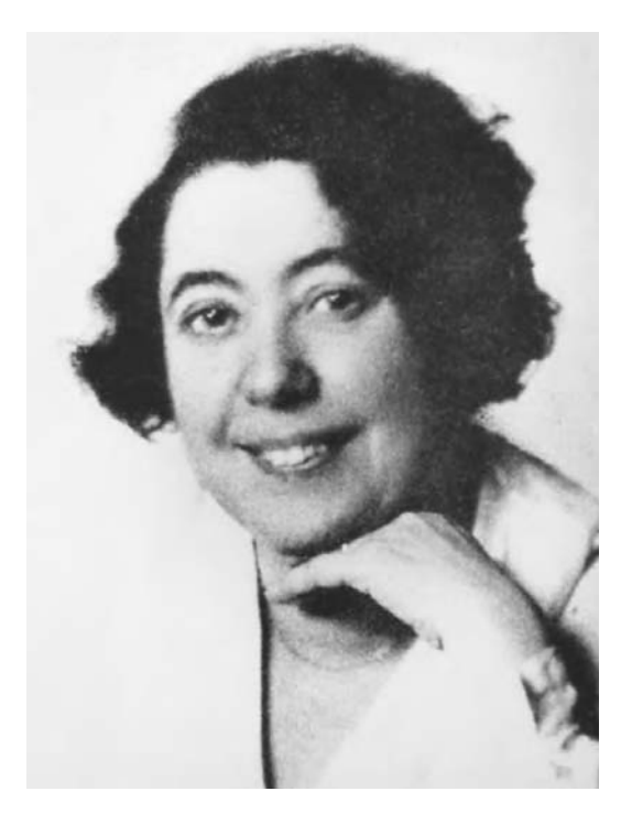
Lina Solomonova Stern

Academy of Sciences of the Soviet Union. She discovered the hematoencephalic barrier, which acts as a filtering membrane in order to protect spinal fluid and nerves from harmful substances.