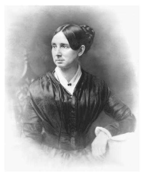
Dorothea Lynde Dix

Dix suffered from poor health throughout