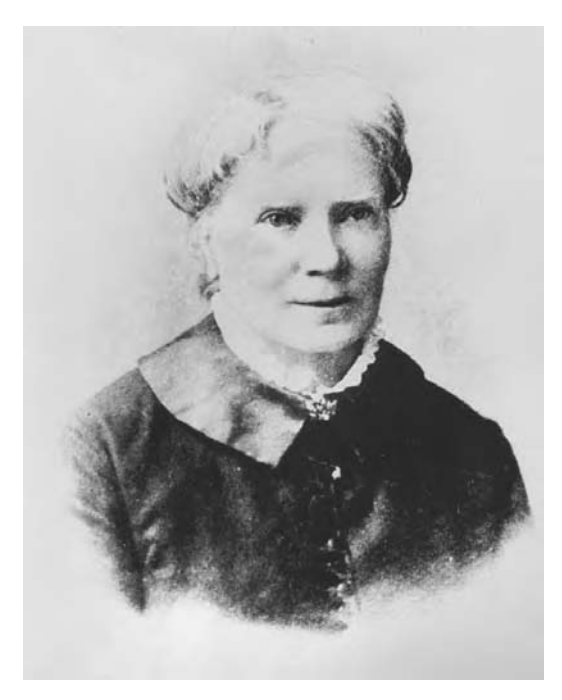
Elizabeth Blackwell

ical education for women, helped found the New York Infirmary for Women and Children, and served the medical profession with high ethical standards.