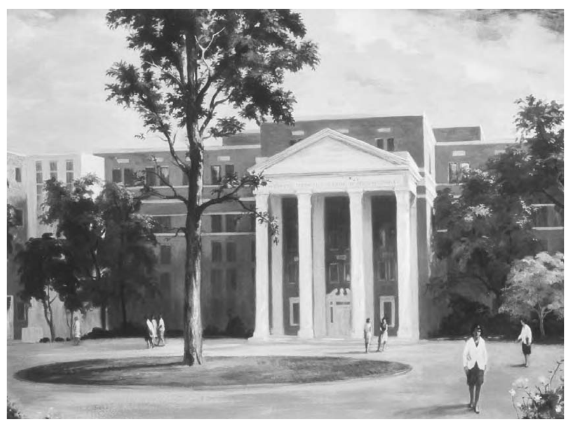
Medical College of Pennsylvania

vania. In 1969, it became coeducational. During the 1920s and 1930s it was the only medical college for women that survived. Struggling financially at times, it stayed a course that would ensure a permanent place in Philadelphia history and in the history of women in medicine around the world.