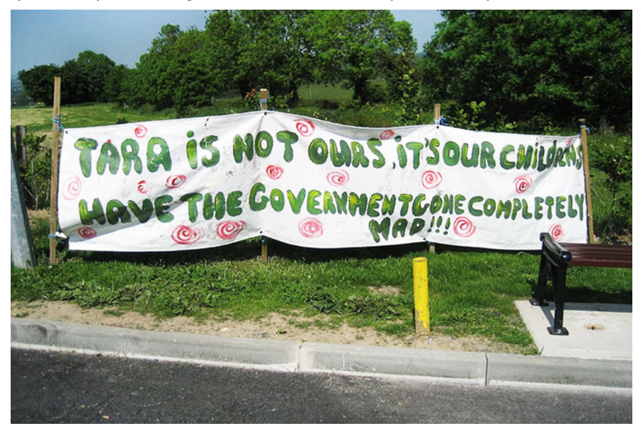
Figure 6. Protest Sign Outside Tara. (Source: Kathryn Rotondo, Photograph Taken 7 June, 2007).

democracy that were won at such high costs less than a century ago. In the eyes of opponents, it is not the Irish people who have chosen to prioritize infrastructure development over Ireland's sacred sites, but rather corrupt politicians who have been captured by non-Irish private interests. References to the failings of democracy over the issue and allegations of corruption are prevalent among oppositional discourses. In its mission statement TaraWatch presents its main objective as "restoring the democratic deficit on the Tara issue" (TaraWatch 2010, emphasis added ). Taking it further, an editorialist in the Irish Times responded to allegations that the archaeological studies of the site had been falsified, arguing that "altering independent advice to fit hidden agendas is a dangerous corruption of [the] working of Government in itself, more typical of systematically dishonest regimes than a democratic country like ours" (Byrne 2008).