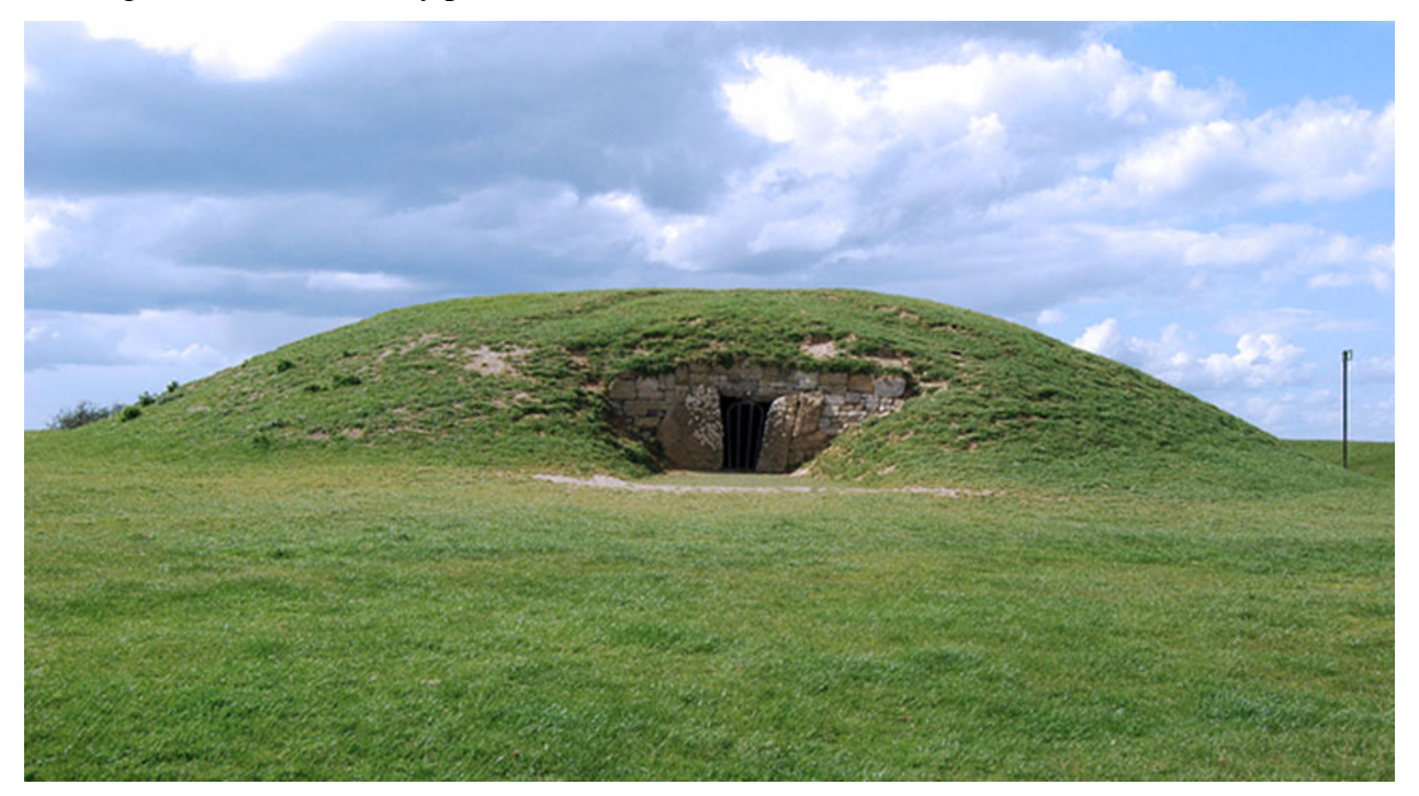
Figure 1. The Mound of Hostages on the Hill of Tara.

been a sacred site to the early peoples of Ireland, and also to modern Irish whose Catholicism forms a central component of their personal and nationalistic identities. Indeed, Tara symbolizes a sacred crossroads in Irish history – one where the transformation of the very soul of Ireland was negotiated in a relatively peaceful manner.