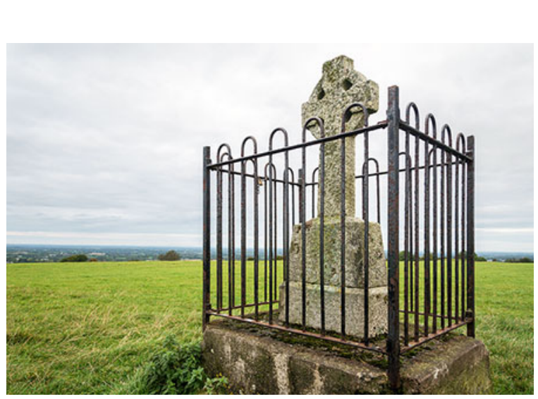
Figure 2. The Lia Fail at the Hill of Tara.