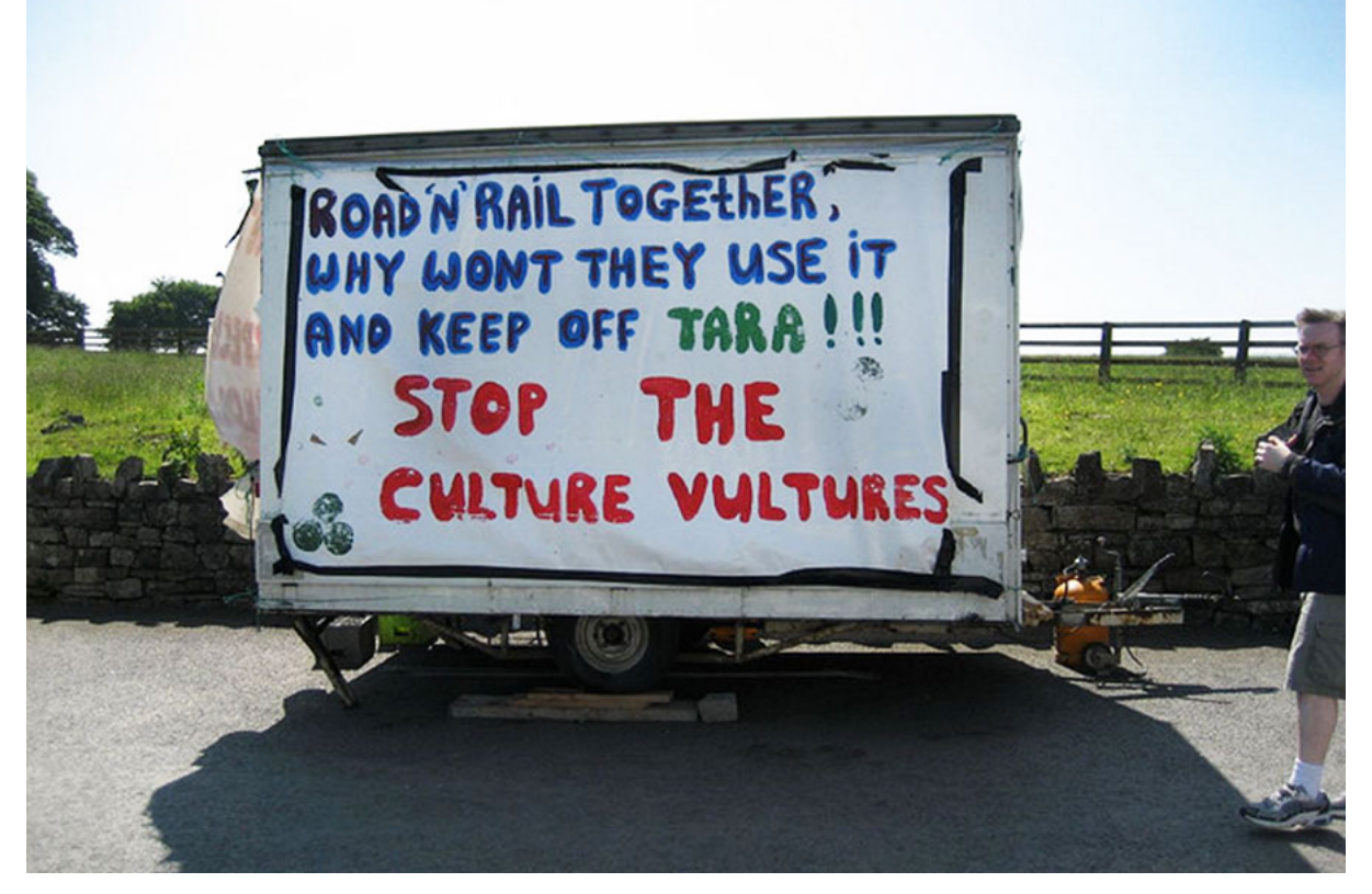
Figure 5. Protest Sign Outside Tara. (Source: Kathryn Rotondo, Photograph Taken 7 June, 2007).

group at the heart of the resistance was TaraWatch, a loosely structured internet-based organization led by Dublin lawyer Vincent Salafia. Throughout their campaign, TaraWatch utilized an array of institutional and extra-institutional strategies of action to garner support for its cause. These included direct protest, letter and petition writing campaigns, lawsuits, and appeals to the international community. While construction on the road continued, TaraWatch gathered supporters. At the height of the conflict in 2009, the group had over 13,000 official members, a sizeable support network amongst the Irish diasporic community in the United States, active membership involved in protest events as far away as Australia, New York, and Los Angeles, and backing from internationally-known Irish celebrities, including Bono, Jonathan Rhys Myers, Gabriel Byrne and Stuart Townsend (Tara Watch 2010). Archaeological, governmental and public interest organizations from around the world, including the Archaeological Institute of America, the International Celtic Congress, the City of Chicago, and the Massachusetts Archaeological Society issued public statements denouncing the construction and joined TaraWatch in urging that the road be re-routed outside the Tara complex (Tara Watch 2010). While TaraWatch certainly had support from community members, as evidenced by the