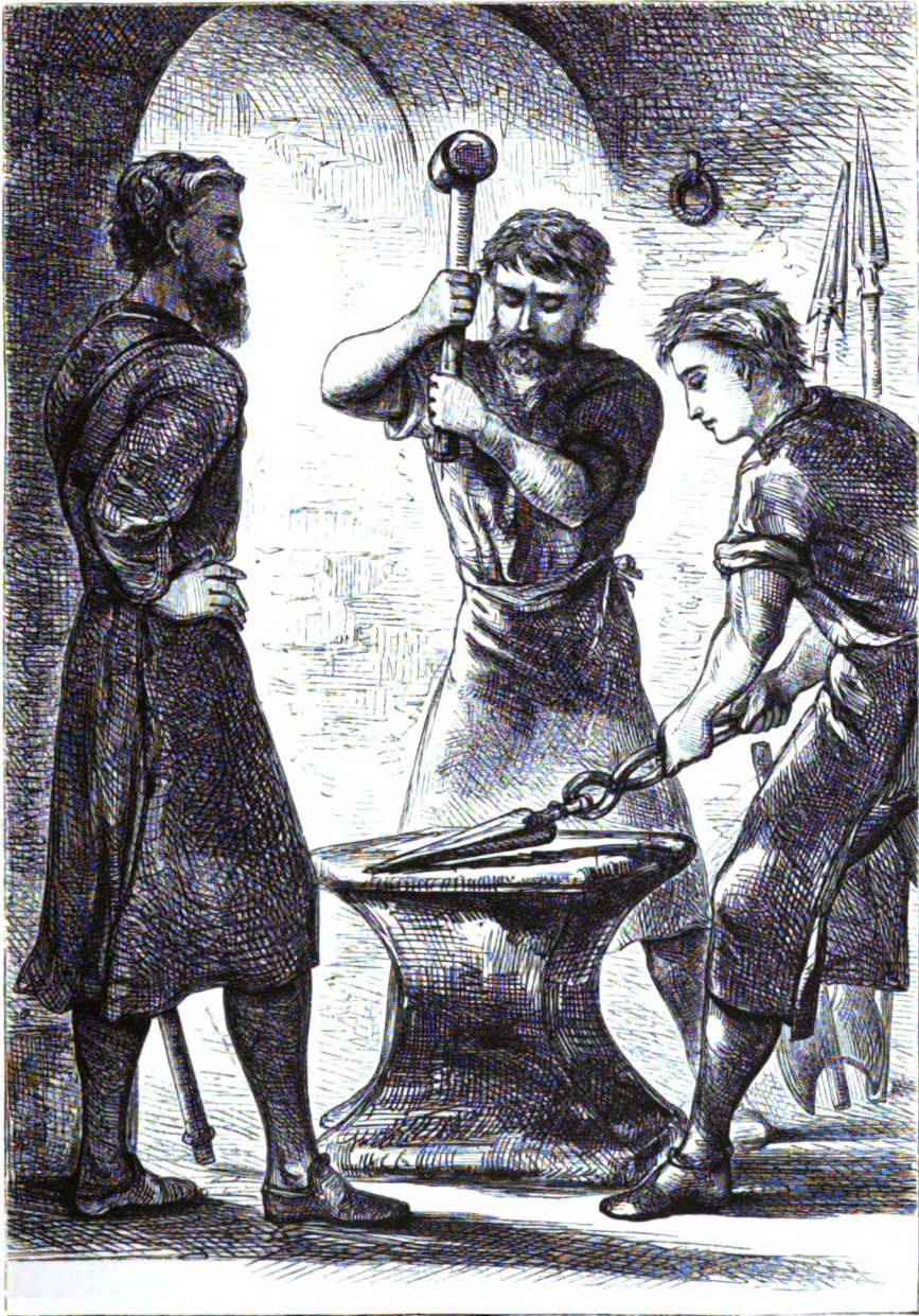
FORGING THE SPEAR-HEAD.