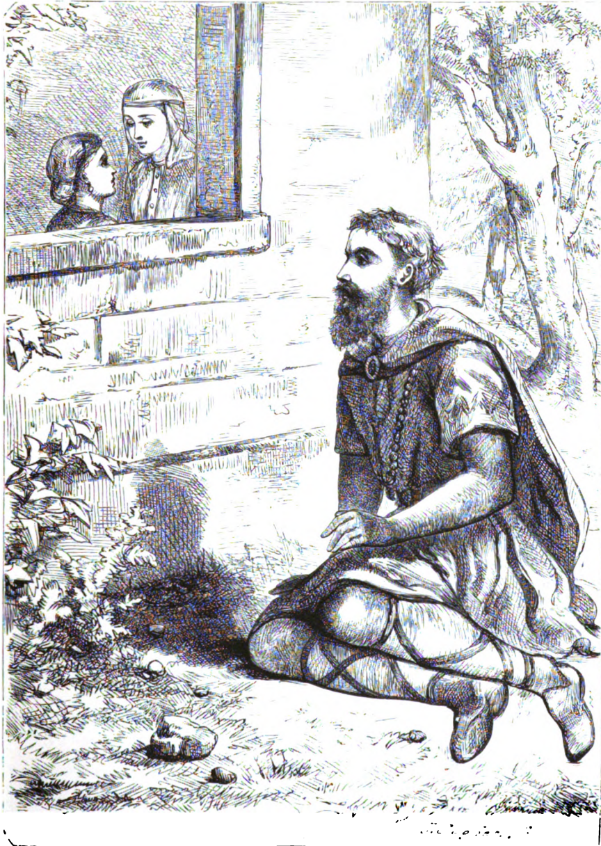
THORKEL AT AUDA AND ASGERDA'S BOWER.