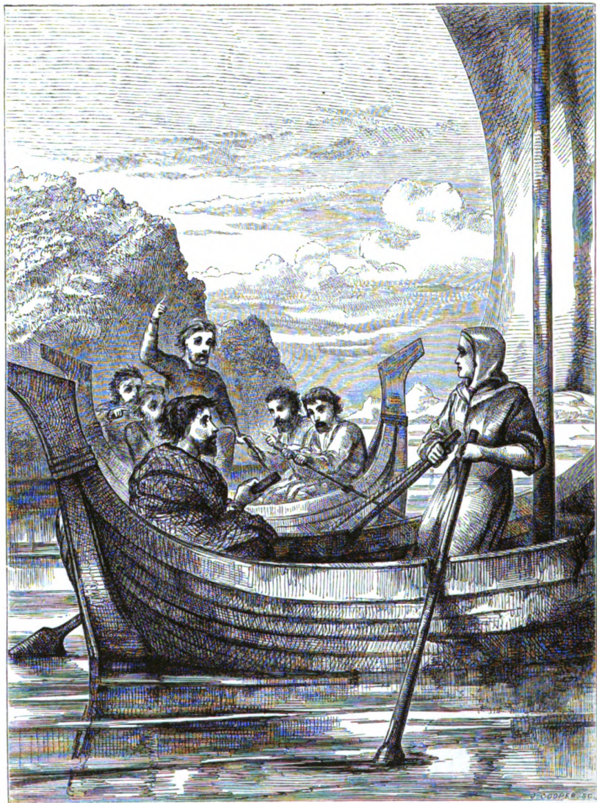
GISLI SLIPS THROUGH BORK'S FINGERS.