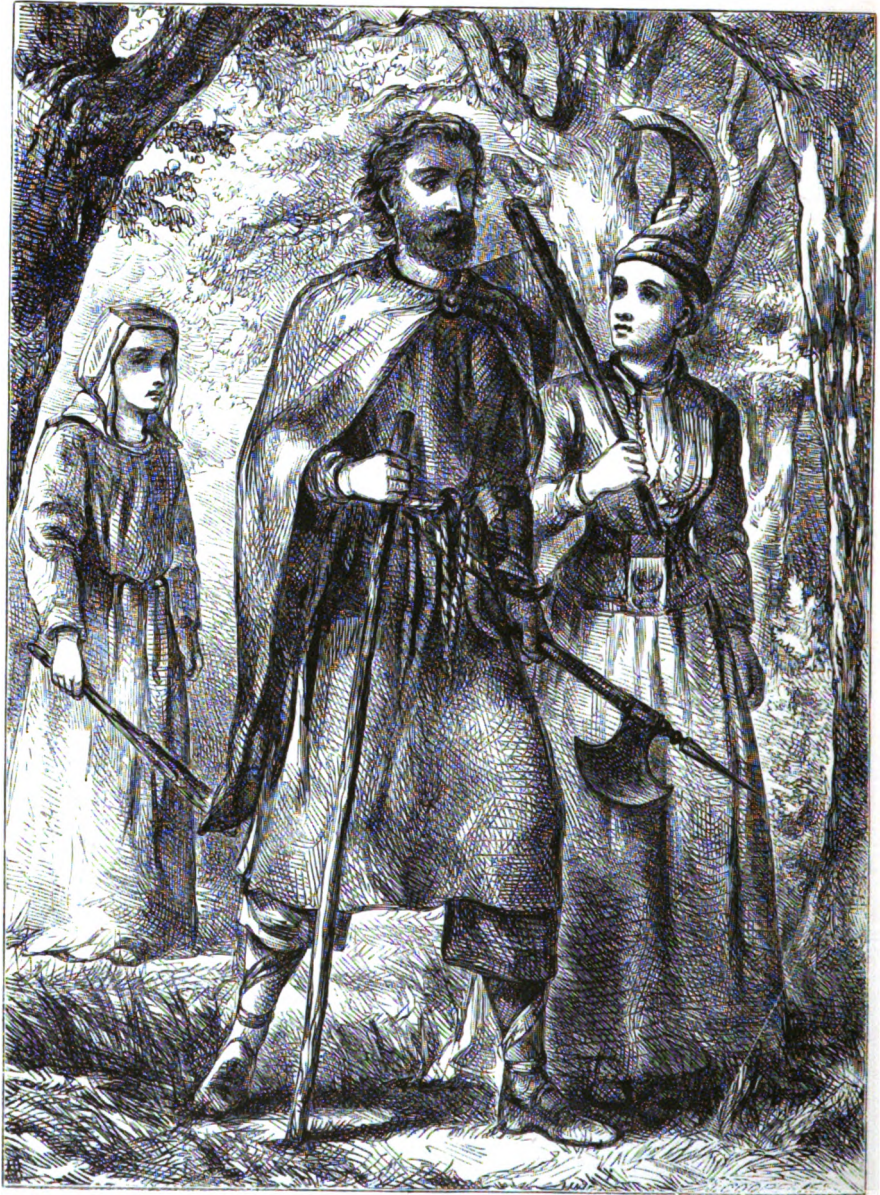
GISLI, AUDA, AND GUDRIDA.