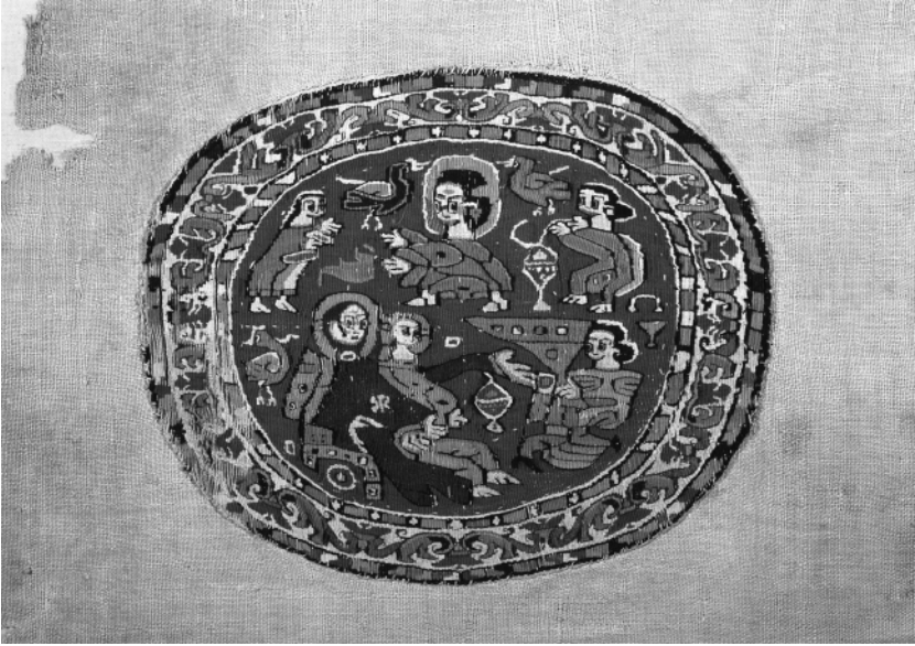
Fig. 37.5 Detail of a linen tunic from Egypt: medallion depicting the adoration of the magi

pre-Constantinian art, it is notable that New Testament miracles predominate thereafter. A gold glass bowl (see Fig. 37.6), probably originally from Rome but now in the Metropolitan Museum in New York, features a number of Christ's miracles, notably all accomplished with the aid of a wand: we see Christ turning the water into wine at Cana, telling the paralytic to pick up his bed and walk, and saving the three youths in the fiery furnace (the other figure is Tobias, reaching with his right arm into the mouth of the fish). In each of these images Christ holds a wand, a feature certainly not present in any of the Gospel accounts of his miracles, yet his standard attribute in early Christian miracle images. The wand works to stress the miraculous moment, and to highlight the role of Christ as miracle worker, bearer of a tremendous power.