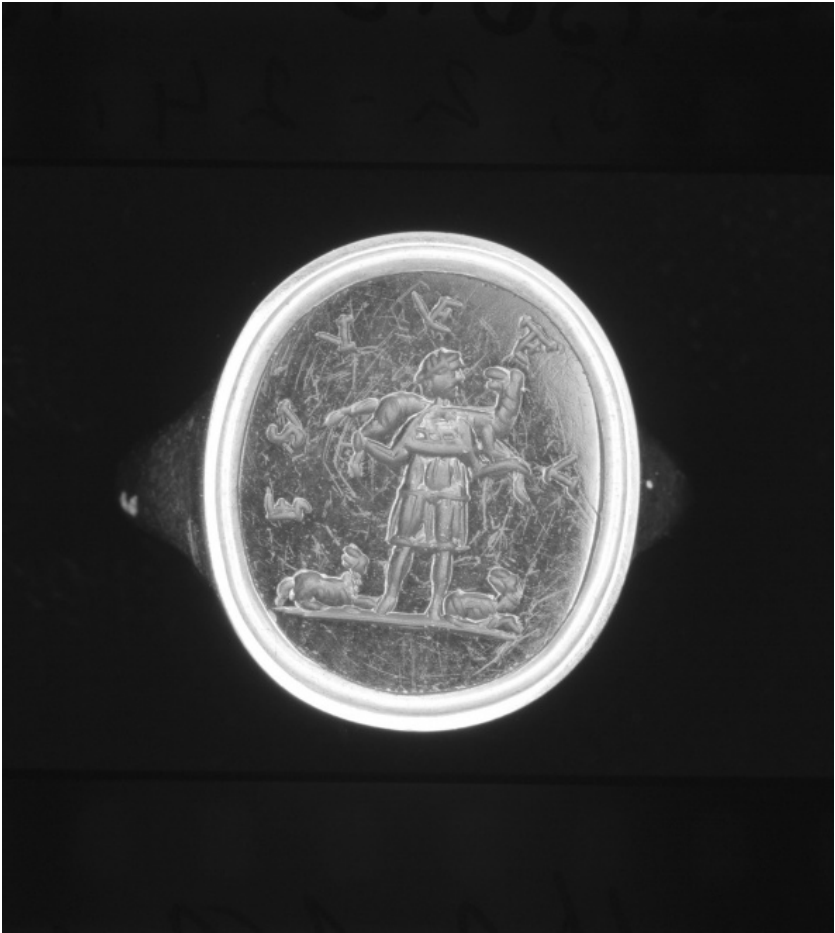
Fig. 37.2 Finger ring depicting the good shepherd

ram-bearer, the kriophoros , was far from being a uniquely Christian image, but was ancient and widespread, 19 and would have been familiar to people from all religious backgrounds. The shepherd, therefore, was an iconographic motif that was ripe for adaptation by Christians: a familiar subject, which could take on a new, specifically Christian, significance for initiated viewers. 20