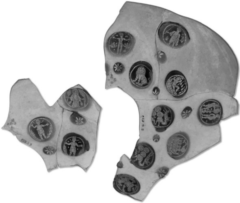
Fig. 37.3 Gold glass bowl from Cologne depicting the Jonah cycle

Cologne, now in the British Museum (see Fig. 37.3). The clear glass bowl is decorated with a series of small medallions, on which figures are marked in gold leaf, including both individual scenes and cycles, four pictures of which tell the story of Jonah. We see the ship in the sea with the whale (looking more like a veritable sea monster!) alongside; we see the sea monster swallowing Jonah (only his legs are visible!), then we see the beast degorging him again; finally we see the prophet sulking beneath the gourd.