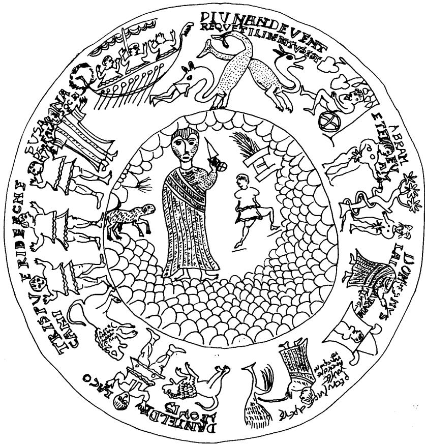
Fig. 37.4 Drawing of the Podgoritz cup

connection between prayer and image and also points to the variety of ways in which the Bible could have been communicated in the ancient world. The prayers that made up the commendatio animae , in whatever form, transmitted orally as well as textually, took their substance from the scriptures, this much is obvious. However, it then also follows that the biblical stories would then have been disseminated via the medium of the prayers, as well as (or even instead of) biblical readings. Finally, it is obvious that the stories would have been known from works of art, which were themselves reproduced in other works of art (through repetition and the use of pattern books). That is, our putative ancient Christian could have learned the story of Jonah from a variety