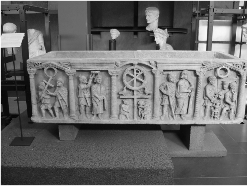
Fig. 37.7 Sarcophagus depicting Christ's passion

passion narrative in four scenes: it is in the third scene that Christ's crucifixion is presented, juxtaposed, to the left, with the suicide of Judas, while three figures (Mary, John and another male figure) accompany Christ to the right (see Fig. 37.8). 35 Even from this time onwards images of the crucifixion are still few and far between, though they pick up in the East in the sixth and seventh centuries.