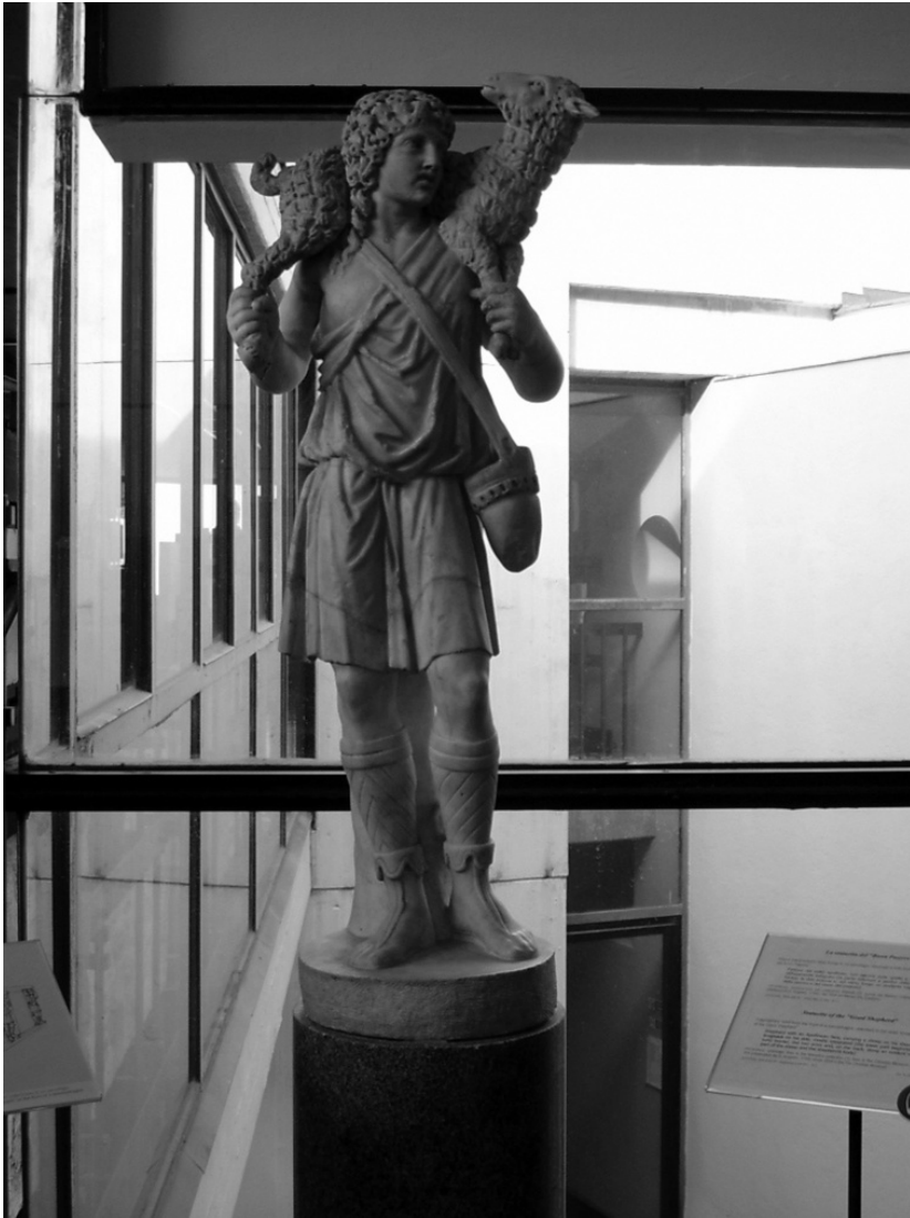
Fig. 37.1 Statuette of the good shepherd

the shepherd is well known: first from Old Testament texts (Ezek. 34:23; Isa. 40:11), but especially from Gospel parables (Luke 15, John 10), most famously in Jesus' claim that 'I am the good shepherd: the good shepherd lays down his life for his sheep' (John 10:11). However, the figure of the shepherd, or