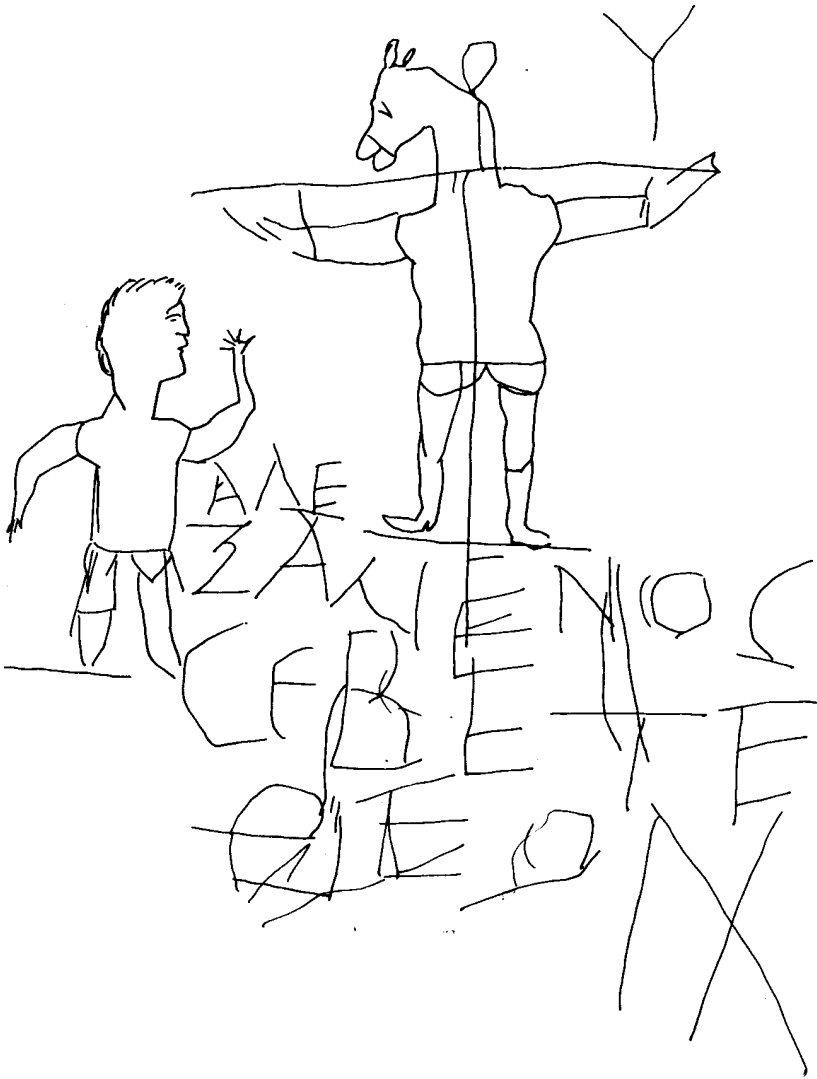
Fig. 37.9 Graffito from the Palatine at Rome depicting a crucified donkey with the caption: 'Alexamenos worships [his] God'

tradition passed on to Jesus, an extra source of his divine power. In many depictions, indeed, the magi wear 'Phrygian' caps, recalling both their eastern origin, and, by extension, their association with eastern wisdom and magic.