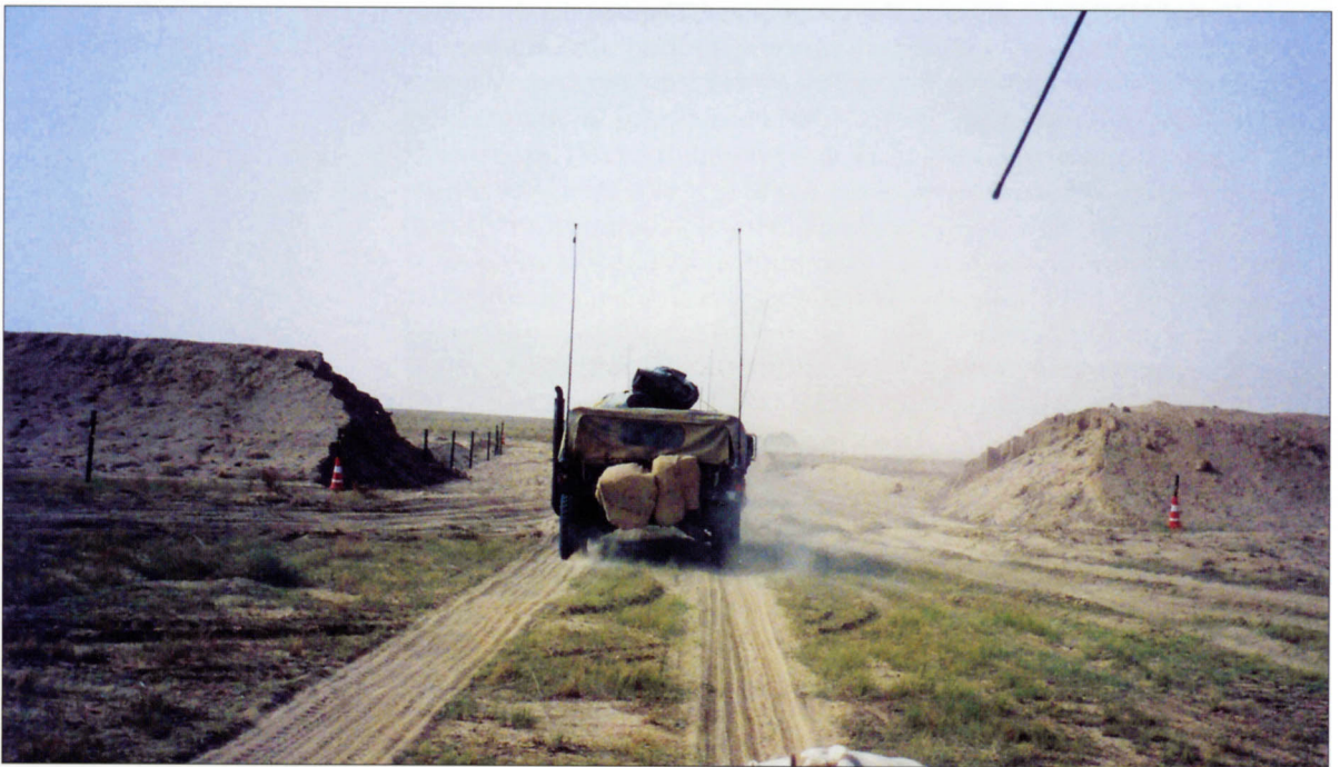
BELOW 3d Battalion, 2d Division Marines moving through the breach in the border berm between Kuwait and Iraq.