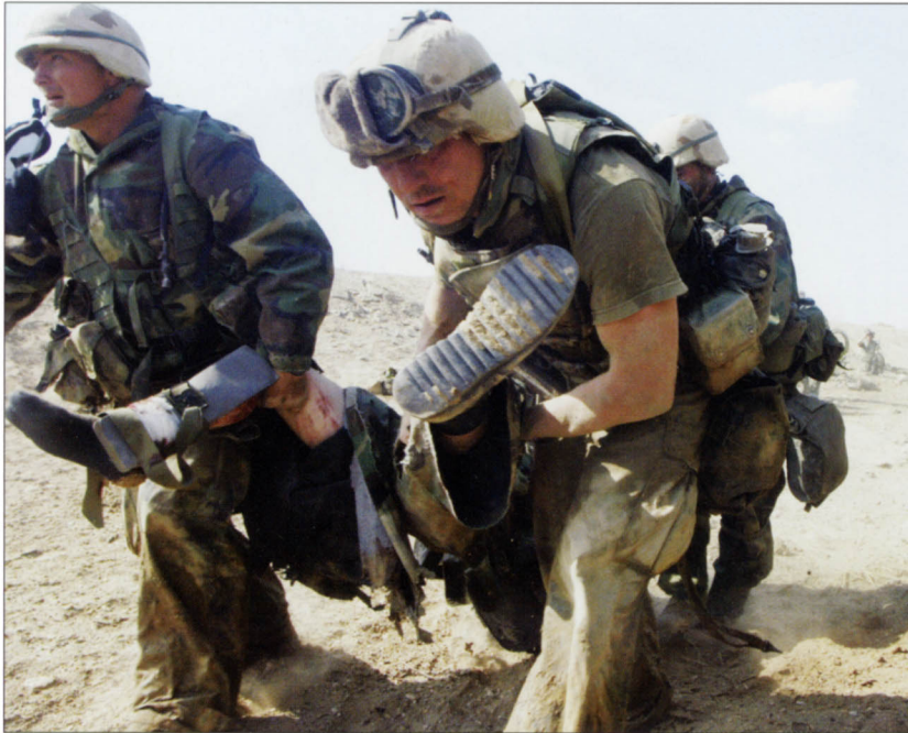
LEFT Charlie Company Marines carry a wounded comrade during the battle for the northern bridge over the Euphrates River.