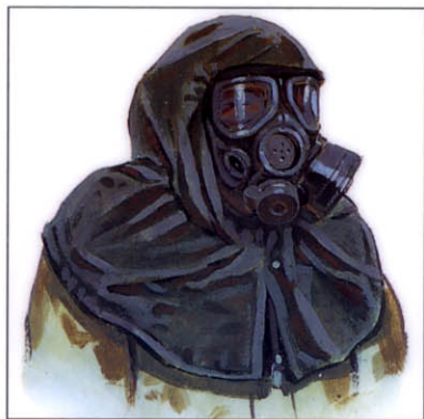
Clothing and equipment

Insights into the daily lives of history's fighting men and women, past and present, detailing their motivation, training, tactics, weaponry and experiences