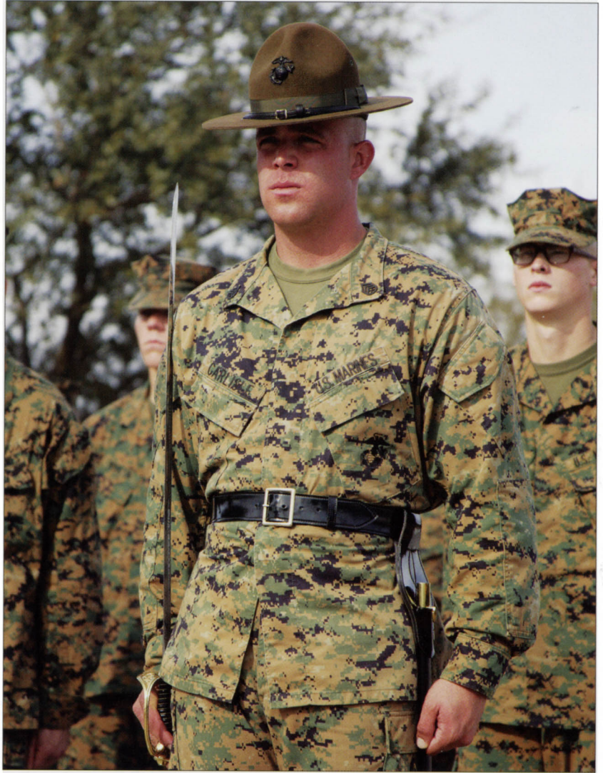
RIGHT A US Marine drill instructor at Parris Island, South Carolina.

every recruit. They are taught that the only way to lose is to quit. They are conditioned with a regime of diet and exercise to turn them into physically fit warriors. They learn how to handle and care for their M16A2 rifle as if it were an extension of their body.