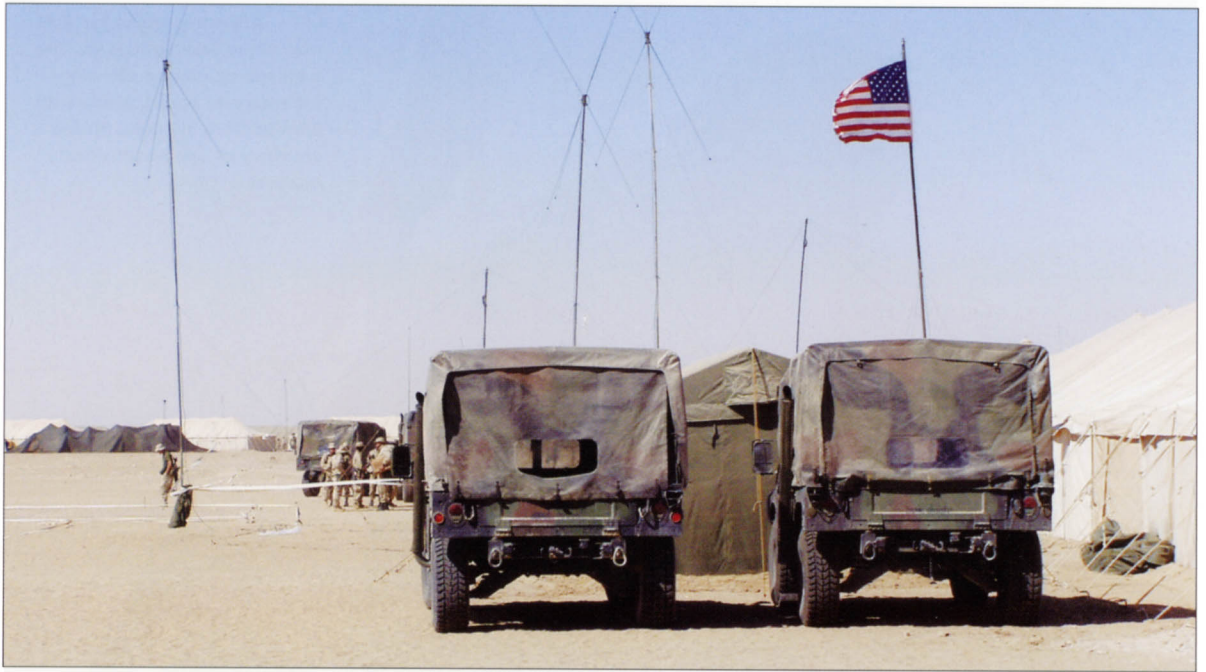
ABOVE Regimental Headquarters at Camp Shoup, Kuwait.

remaining members of his squad, and they packed up and climbed into C211 with their gear. Rumor had it that today's trip would be short.