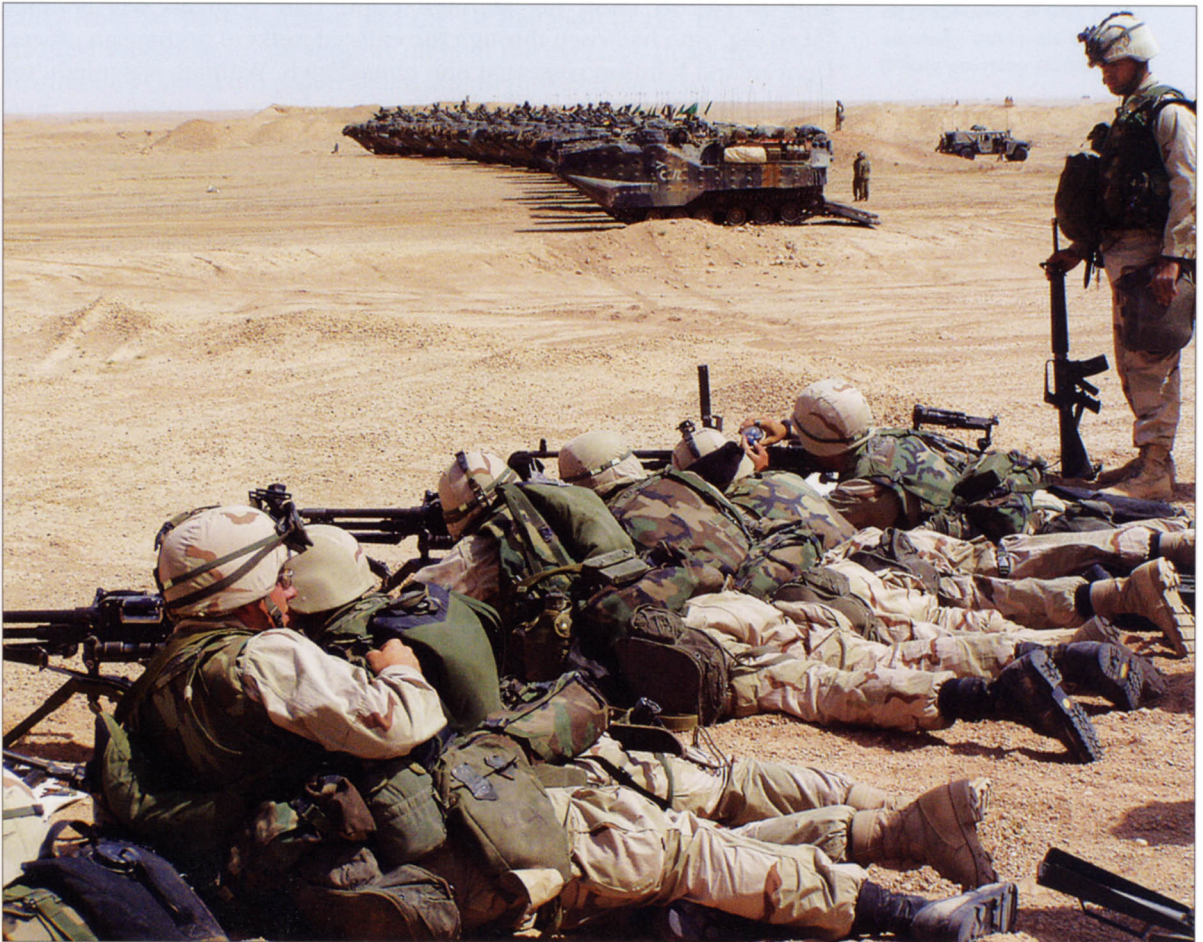
BELOW 1st Battalion, 2d Marines training in the Kuwait desert. On arrival in Kuwait the Marines conducted many training exercises to pull together their expertise and acquaint themselves with the type of terrain that they would be fighting in. This would be the last training opportunity before pushing off into Iraq.