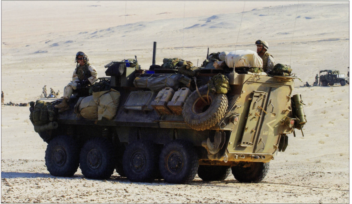
ABOVE A Marine Light Armored Vehicle during CAX at Twentynine Palms, California.

integrated with the AAV company. Each rifle platoon would ride in three AMTRACs or AAVP7 armored assault tracked amphibious vehicles.