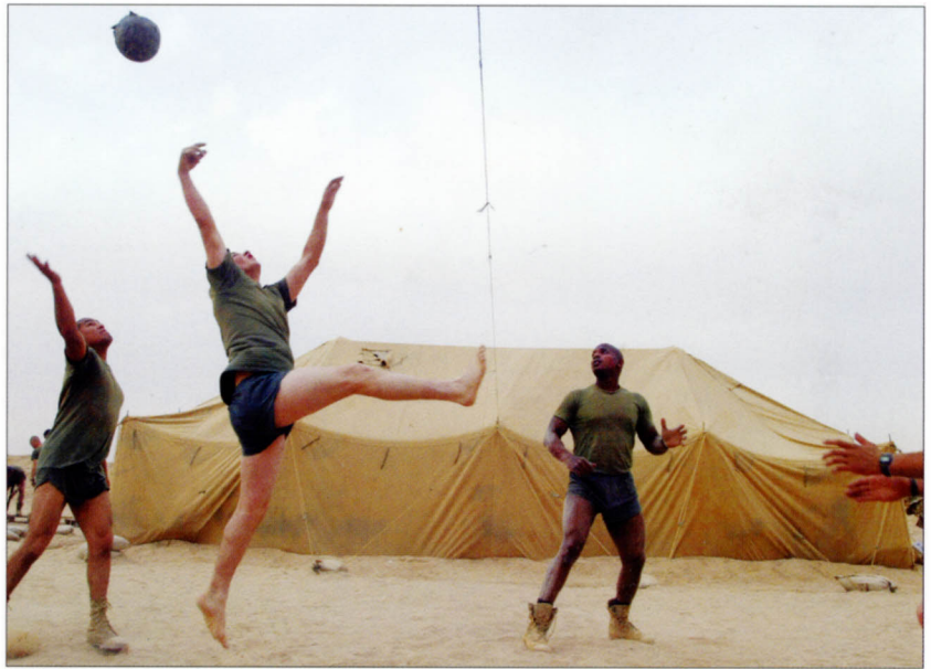
RIGHT Regimental Combat Team-2 (RCT-2) Marines playing volleyball at Camp Shoup in the Kuwaiti desert.

On the morning of March 19, there was a flurry of activity around the camp. The entire regiment was packing up to move. Vehicles were being loaded and some of the tents broken down. Task Force Tarawa's orders had come in. On the 20th, RCT-2 would move to Assembly Area Hawkins at the Kuwaiti border. On the morning of the 21st, they would attack into Iraq.