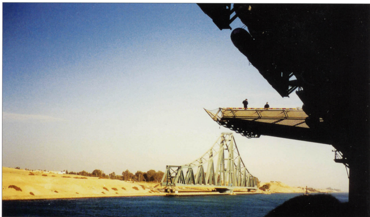
ABOVE Marines transiting the Suez Canal on their way to war in Iraq.