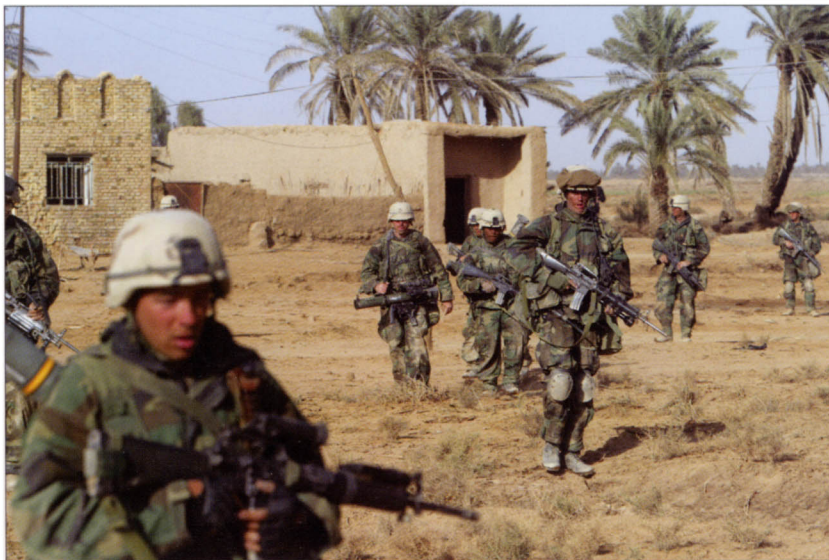
LEFT Marines from the 1st Battalion, 2d Marine Regiment, clear a small village near the southern Iraqi city of An Nasiriyah.

The 1st Marine Division encountered ever-increasing resistance as they moved closer to Saddam's center of power. By the time the Marines reached Baghdad, the Iraqi leadership was on the run. They moved into