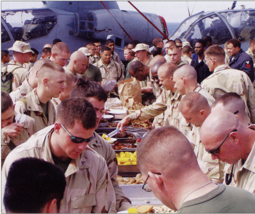
LEFT Marine officers and Staff NCOs serve meals to enlisted Marines on the flight deck of USS Ponce. The Marines learn from the start of their training to treat their staff sergeants and superiors with the utmost respect as part of the Marine ethos and, in turn, officers and NCOs take care of their Marines. One longstanding tradition is that the enlisted men are fed before their leaders.

secured Iraq's "second" city, Basrah. Camp Lejeune's 2d MEB was given the mission of keeping the supply routes clear behind the 1st Marine Division's attack.