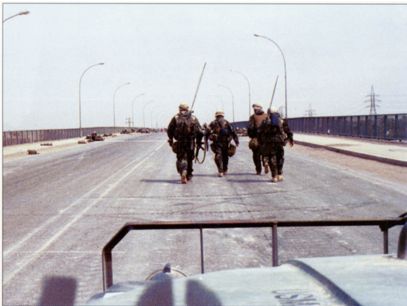
LEFT 2d Battalion, 8th Division Marines on the Southeastern Euphrates River Bridge on the morning of March 24, 2003. Note that they are dressed in full woodland camouflage MOPP gear, with webbing, and the Marine on the far left is carrying his M16A2 rifle.

The Marines in Alpha Company's tracks nervously waited in the hot metal boxes. Finally, the familiar order came, "Dismount!" and each track's heavy metal ramp fell. The Marines poured out as the entire rifle company deployed. As Alpha Company's Marines fought to defend their newly captured prizes; Bravo Company reached the eastern edge of the city and open terrain. They fanned out into an open field. The tracks groaned and slowed, then stopped. They were stuck. Some had sunk in muck to their chassis. There was no time to warn the others – tanks sunk to a halt, and HMMWVs slid into the gooey mess. The eastern thrust was