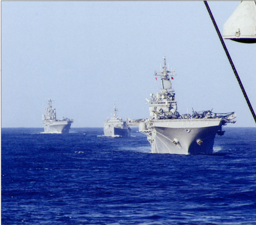
LEFT Ships of Amphibious Task Force-East (ATF-E) carrying Task Force Tarawa Marines to war. During the long journey aboard ship to Iraq the Marines played video games, watched war films, read magazines, newspapers, and letters from home over and over to pass the long hours.

completed and signed. Equipment needed to be inventoried, inspected, and packed, and Marines had to be loaded aboard their ships.