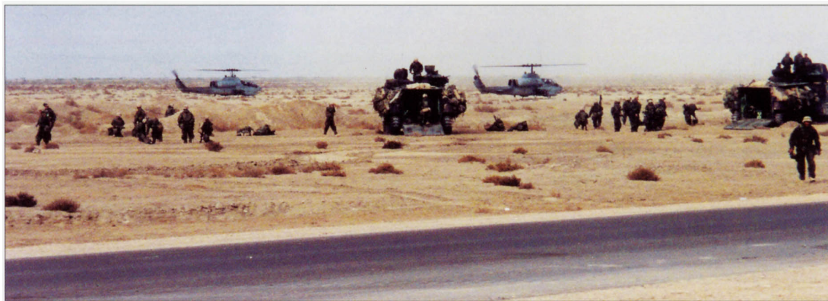
BELOW 1/2 Marines deploy south of An Nasiriyah on March 23, 2003. Cobra helicopters are waiting for their turn to support the Marines further north.

Soon, nine Iraqi tanks lay silent on the battlefield. Tanks were not the only threat at the bridge. Iraqi machine gunners were firing on the Marines from buildings on either side of the road. Black-clad figures