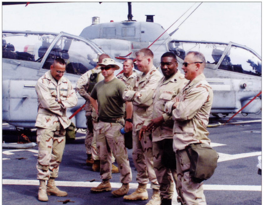
RIGHT Aboard the USS Ponce on the way to war. Here the Marines are seen in their desert camouflage uniforms. Unlike the woodland camouflage pattern on their MOPP suits, these were designed to help them blend in with their combat environment.