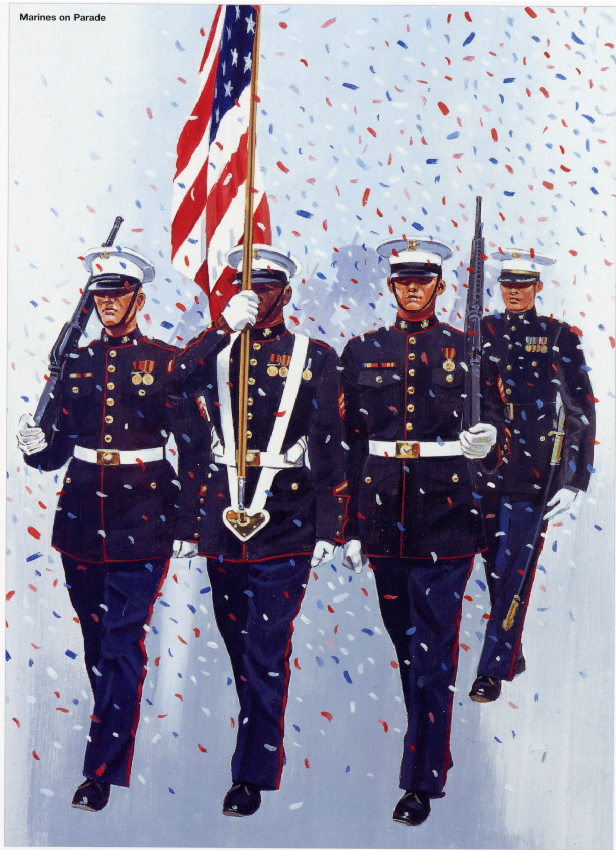
Marines on Parade