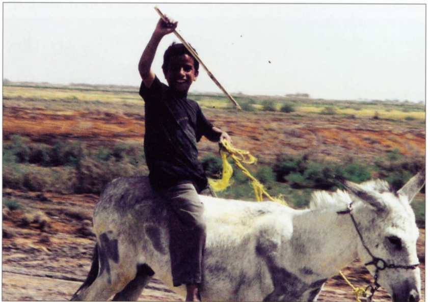
RIGHT An Iraqi boy on the outskirts of An Nasiriyah.

Task Force Tarawa patrolled the streets of the towns of the Fertile Crescent. They met with local officials, handed out food and water, and started rebuilding Iraq. The Marines turned from conquest to relief operations. They provided medical care for the people; they repaired electrical networks and water pumping stations. They rebuilt bridges, schools, and mosques. Most importantly, they maintained order and started to aid the local population in rebuilding their lives in a democracy. The MEB staff began measuring success by the number of Iraqi children returning to school.