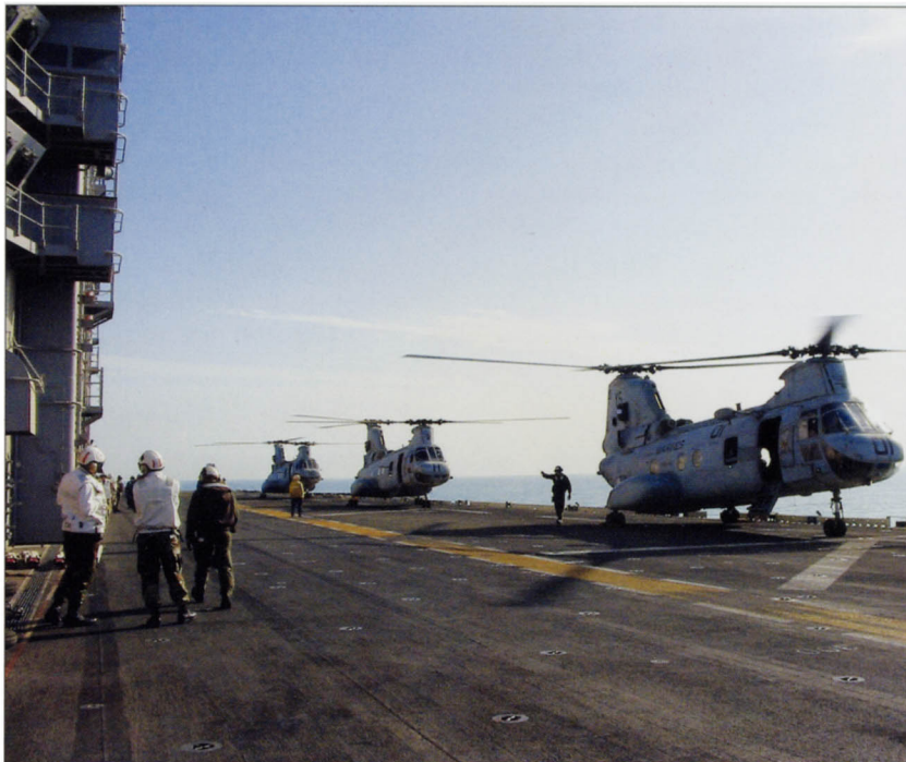
RIGHT Marine CH-46 Sea Knight helicopters on the deck of USS Saipan, preparing to shuttle Task Force Tarawa Marines ashore.