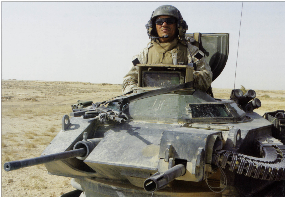
ABOVE A small electric turret, or “up-gun” perched above a Marine AMTRAC houses a.50 cal. machine gun and a MK19 automatic grenade launcher. The track commander typically mans the up-gun.