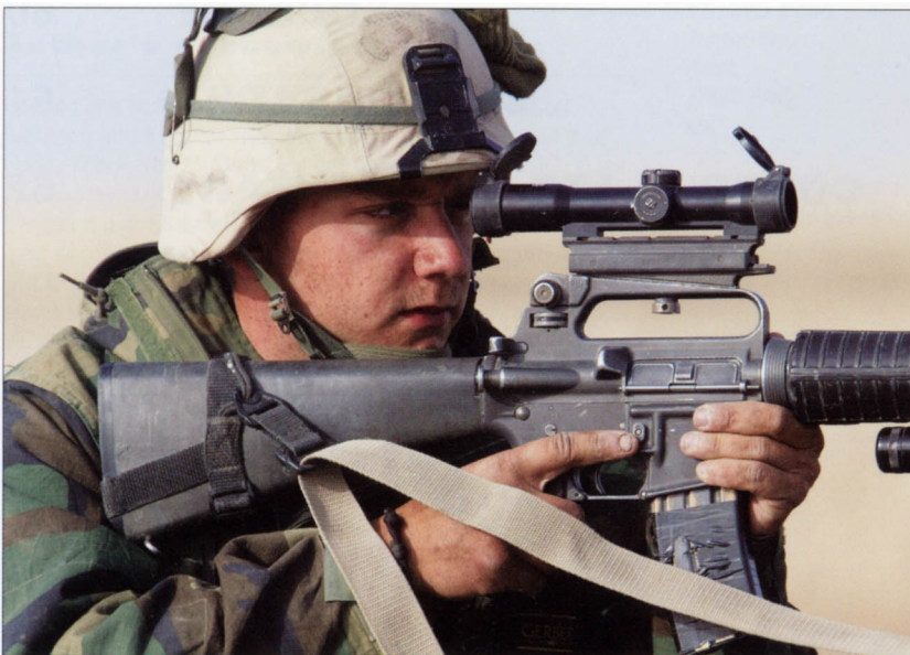
LEFT A Task Force Tarawa Marine scans the southern Iraqi desert, watching for any indication of trouble.

The fertile strip of land that lies between the Tigris and Euphrates rivers is often called the “cradle of civilization,” where man first developed agriculture and the written word. For centuries this area of the Middle East