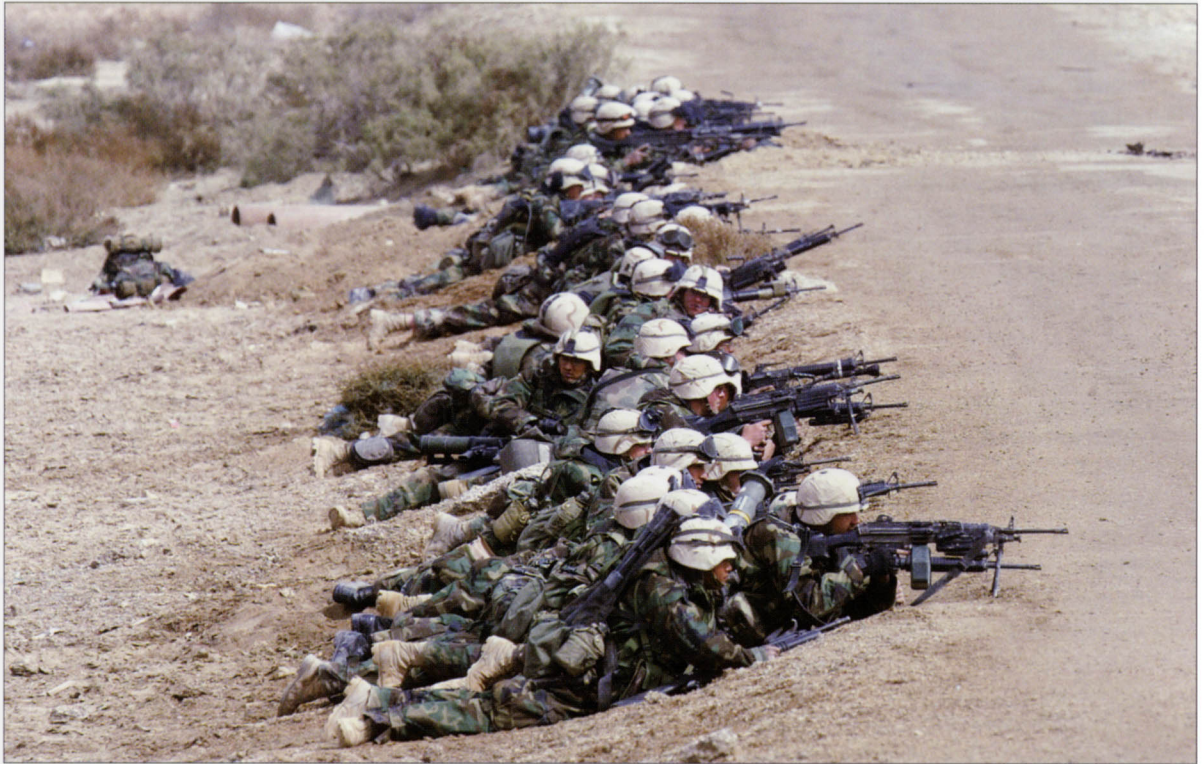
ABOVE 1/2d Marines continue to fight Iraqi troops north of An Nasiriyah.

enemy positions. They were taught to throw standard grenades and fire light- and medium-weight machine guns. They learned how to shoot AT-4 and Shoulder-launched Multi-purpose Assault Weapon (SMAW) rockets, and how to set up and detonate Claymore mines. In addition to their weapons training, they studied basic map reading and land navigation skills, and were trained in basic radio operation.