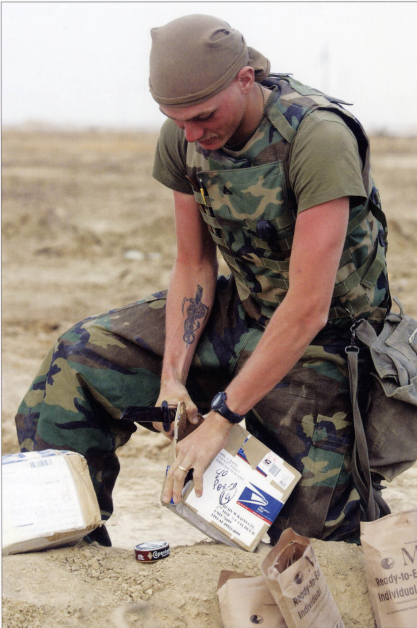
LEFT A Marine opens his first mail since leaving Kuwait. The package contained chewing tobacco and candy, along with a letter from his wife.