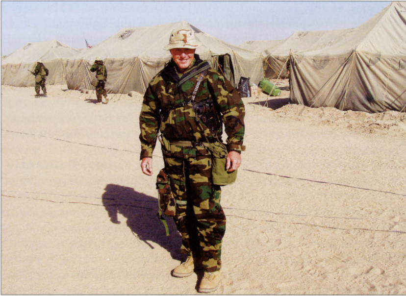
LEFT A Marine from 1st Battalion, 2d Marines in MOPP suit at Camp Shoup, Kuwait. Marines during the long wait in Kuwait, and during the initial combat operations in Iraq, lived under the shadow of potential nuclear, biological, and chemical (NBC) warfare. The MOPP suit is designed to protect the wearer from NBC affects.

move and fight in urban terrain. They learned how to handle enemy prisoners and the basics of battlefield first aid. All the while they continued their daily PT and physical conditioning, with martial arts training and regular 15km (9.3 miles) road marches.