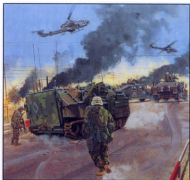
Full color artwork