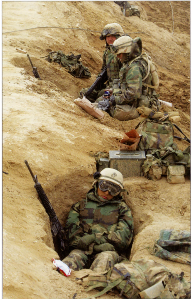
ABOVE Charlie Company Marines dug in to muddy fighting holes after a rainy night north of An Nasiriyah.