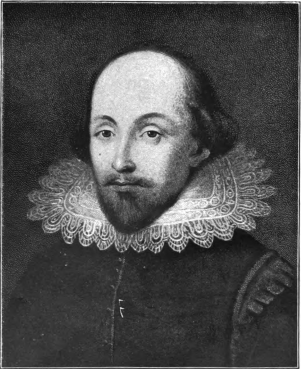
THE JANSEN SHAKESPEARE