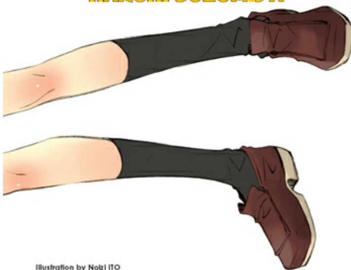
Illustration by Noizi ITO