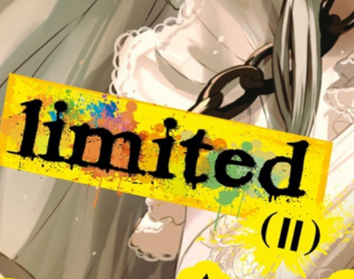
Illustration by Marui-no