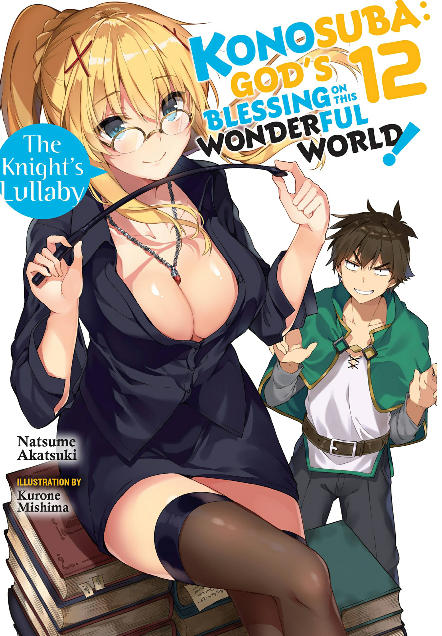
ILLUSTRATION BY Kurone Mishima