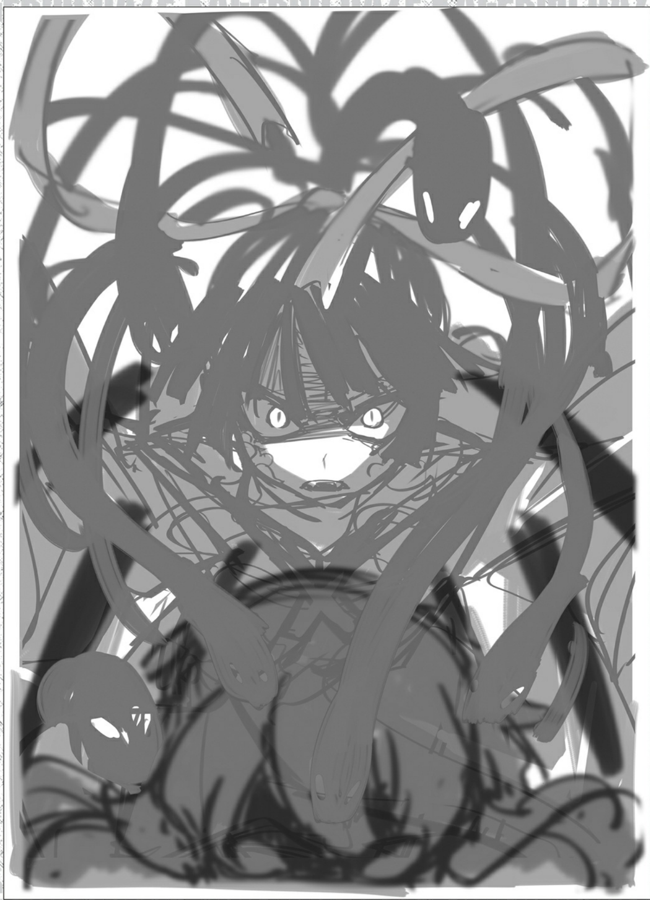
illustration. 7 Sketch