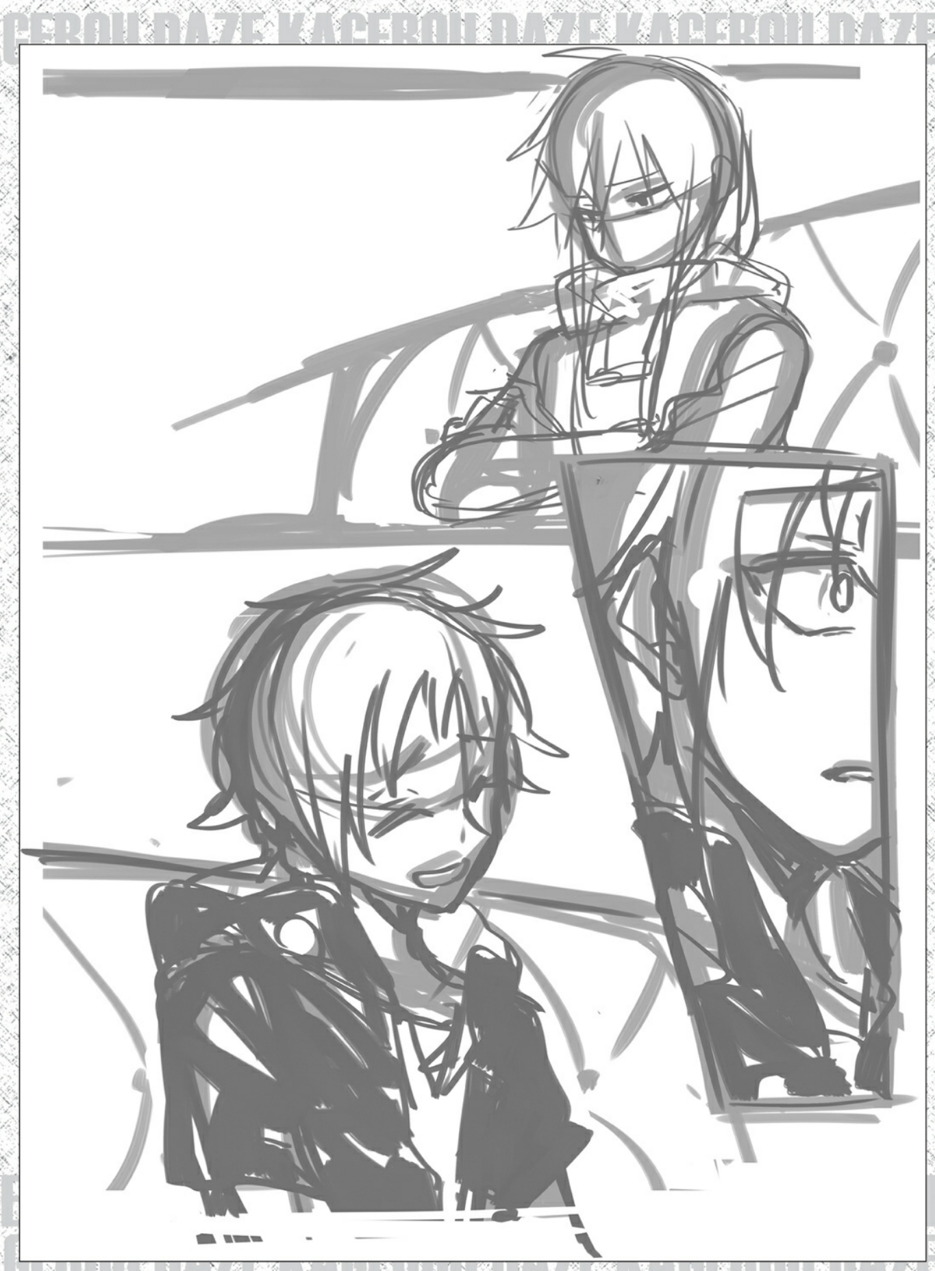
illustration 2 Sketch