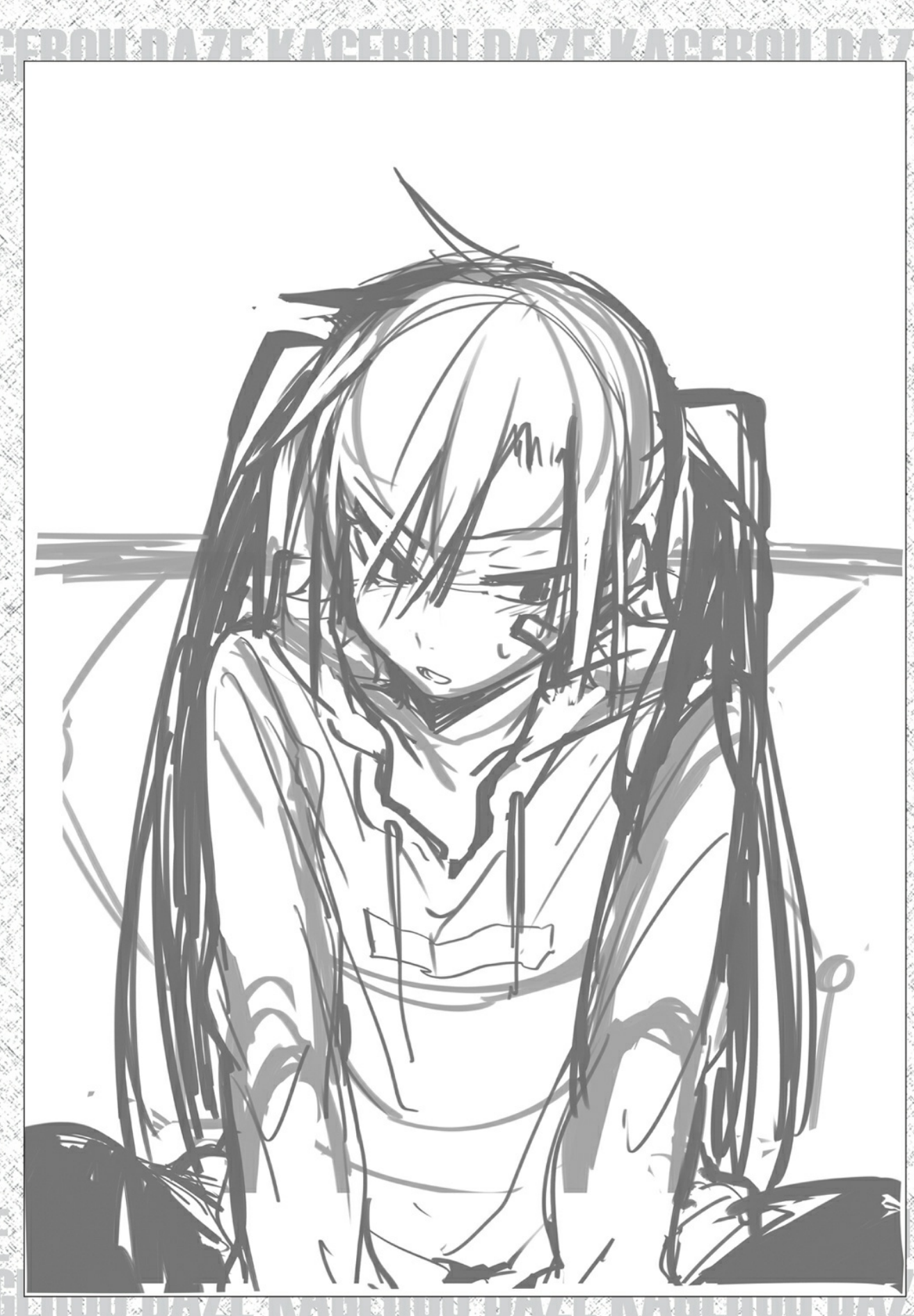
illustration 3 Sketch