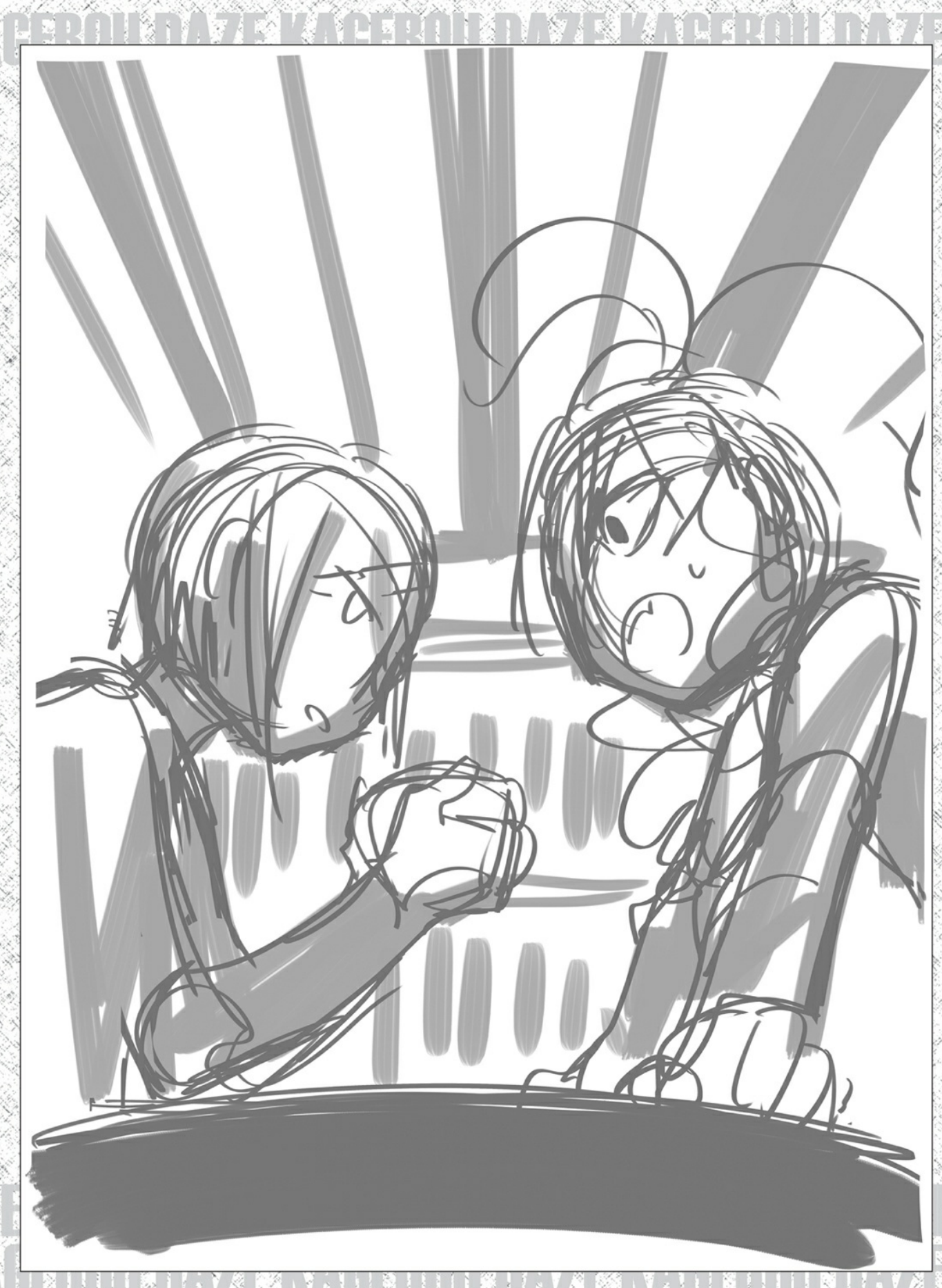
Illustration 6 Sketch