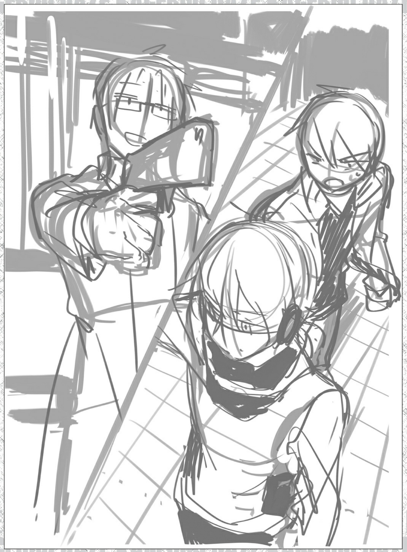
illustration 5 Sketch