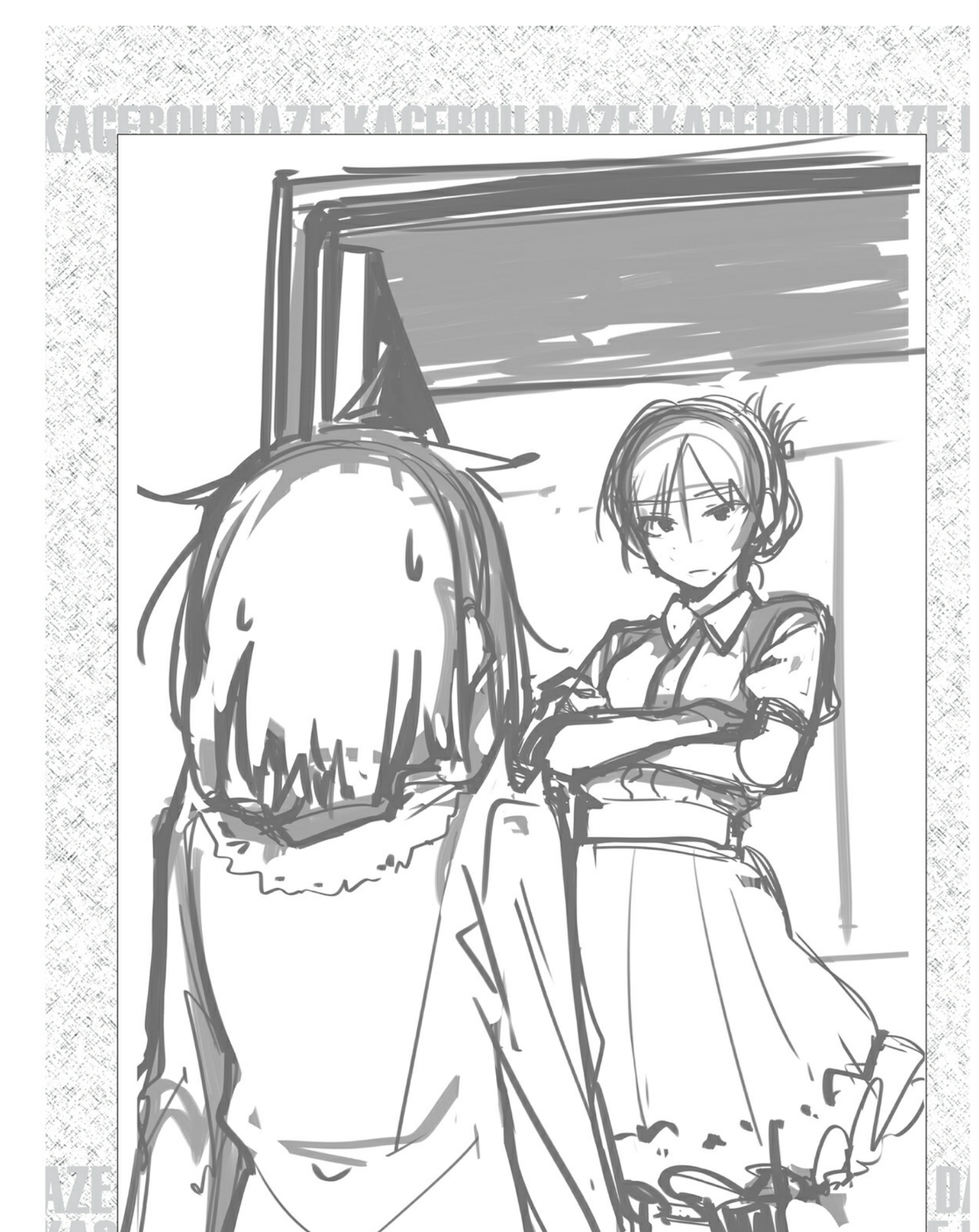
Illustration 1 Sketch