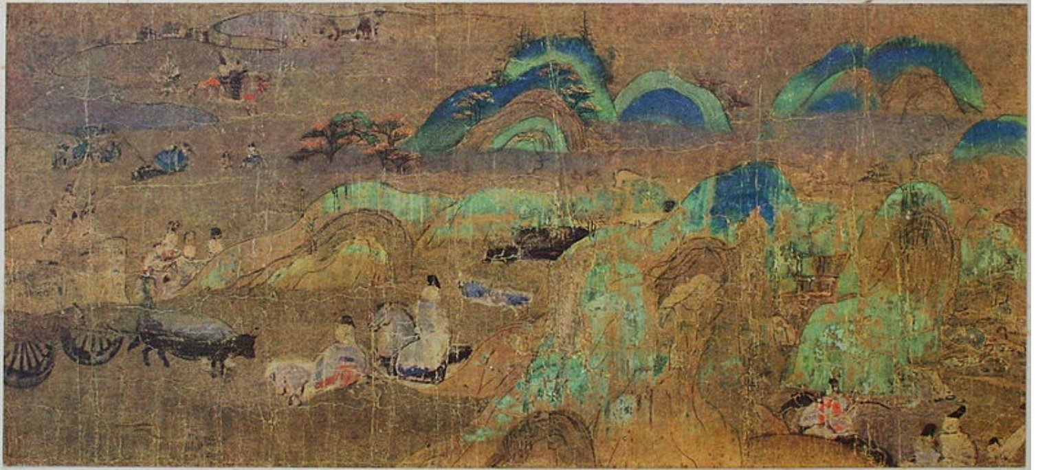
A SCENE FROM THE GENJI MONOGATARI EMAKI, CA.1130, IN THE TOKUGAWA MUSEUM, NAGOYA, JAPAN.

T he vice-governor of Iyo had the year after the death of Genji's father become vice-governor of Hitachi. His wife, the lady of the locust she 11 , had gone with him to his post. In that distant part of the realm she heard of Genji's exile. One is not to imagine that she was unconcerned, but she had no way of writing to him. The winds blowing down over Tsukuba were not to be trusted, it seemed, and reports from the city were few; and so the months and years went by. Although the period of his exile had not been fixed, he did finally return to the city. A year later the vice-governor of Hitachi also returned to the city.