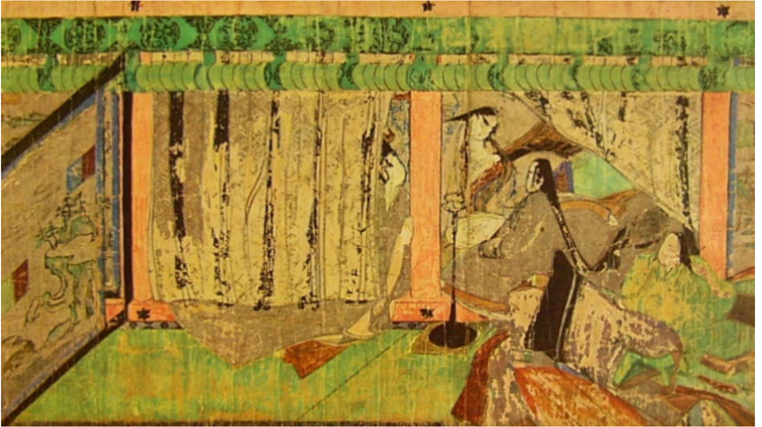
A SCENE FROM THE GENJI MONOGATARI EMAKI, CA.1130, IN THE TOKUGAWA MUSEUM, NAGOYA, JAPAN.

Many still mourned Kashiwagi, who had vanished before his time. Genji tended to feel very deeply the deaths even of people who had been nothing to him, and he had been fond of Kashiwagi and had made him a constant companion. It is true that he had good reason to be angry, but the fond memories were stronger than the resentment. He commissioned a sutra reading on the anniversary of the death. And he was consumed with pity for the little boy, whose agent he secretly thought himself as he made a special offering of a hundred pieces of gold. Tō no Chūjō was very grateful, though of course he did not know Genji's real reasons.