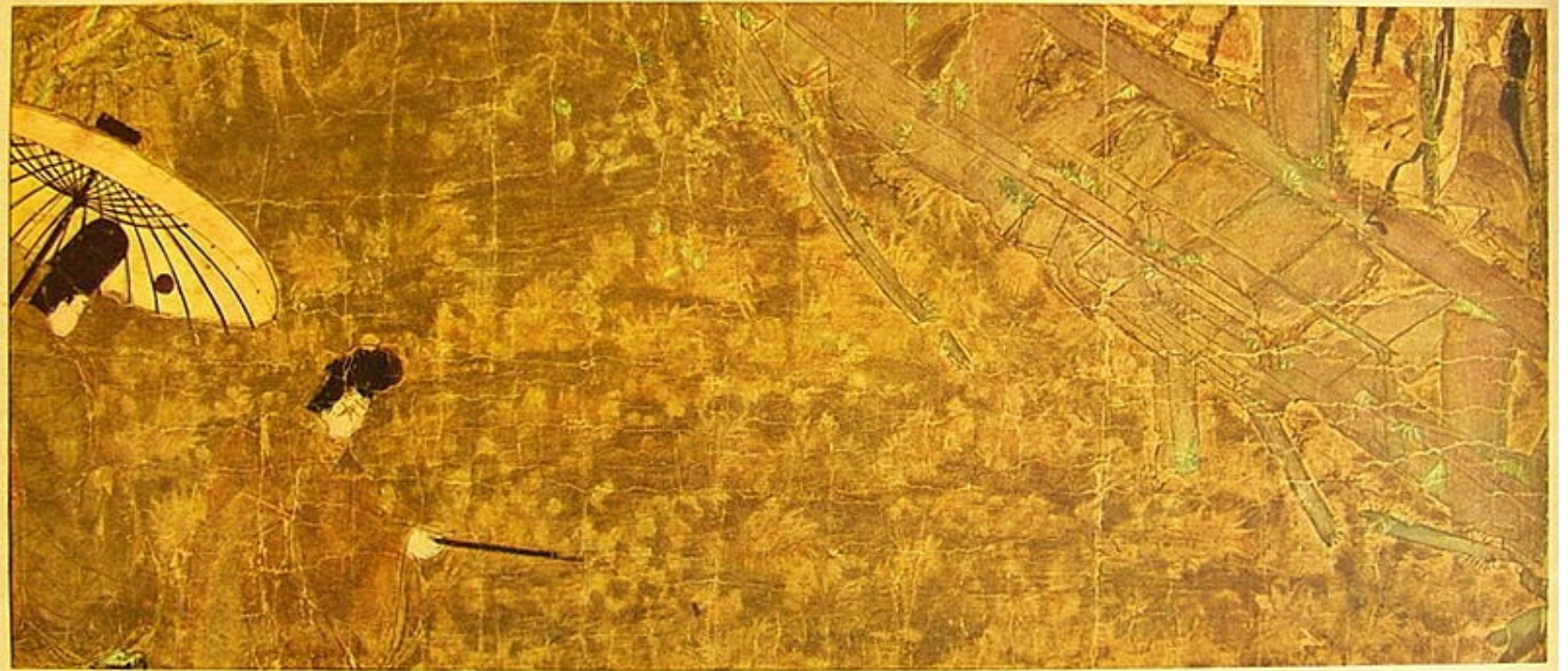
A SCENE FROM THE GENJI MONOGATARI EMAKI, CA.1130, IN THE TOKUGAWA MUSEUM, NAGOYA, JAPAN.

In those days of sea grass steeped in brine, many ladies had lamented Genji's absence and hoped he would soon be back in the city. For ladies like Murasaki, whose place in his life was secure, there were at least letters (though of course they did not completely deaden the pain) to inform them that he was well. Though he wore the plainer clothes of exile, Murasaki found comfort, in a gloomy world, in making sure that they followed the seasons. There were less fortunate ones whom he had not openly recognized and who, not having seen his departure into exile, could only imagine how it must have been.